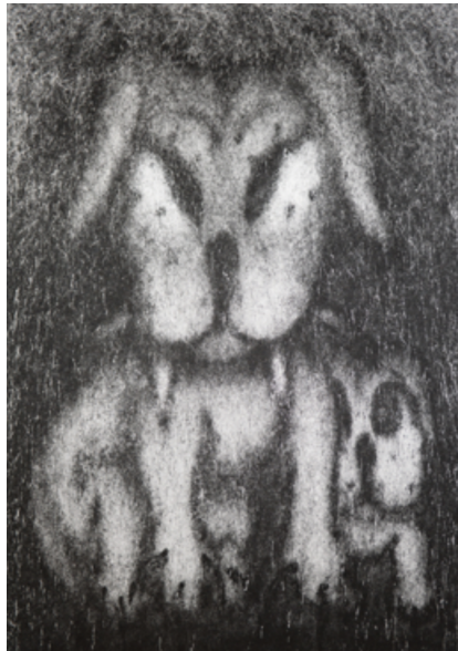
Chito. Untitled , 2022. Acrylic on canvas. 84 x 60 inches.

Opening Reception: Thursday, April 13, 6 - 9 PM. 2685 S La Cienega Blvd Los Angeles, CA 90034