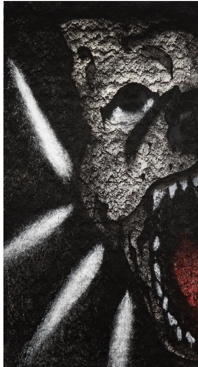
Chito. GUARD , 2023. Acrylic on washi paper. 80 x 42.5 inches.

Allouche Gallery, Los Angeles is located at 2685 S La Cienega, and is home to an international roster of some of the world's most recognized and culturally significant contemporary visual artists. Through its highly curated exhibition program, the gallery has garnered a reputation for highlighting artists – whose work directly challenges preconceived notions of contemporary visual culture – and affirming their place in 21st Century art. Established in 2014, Allouche Gallery's New York location can be found on 77 Mercer St.