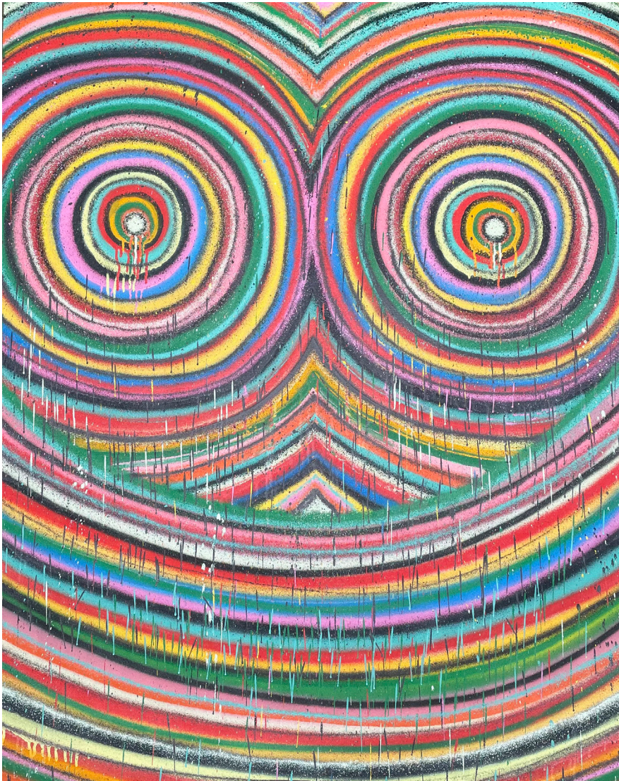
Jonathan Edelhuber I'm Happy That You're Happy, No. 2, 2022 Spray paint on canvas 60 x 48 inches