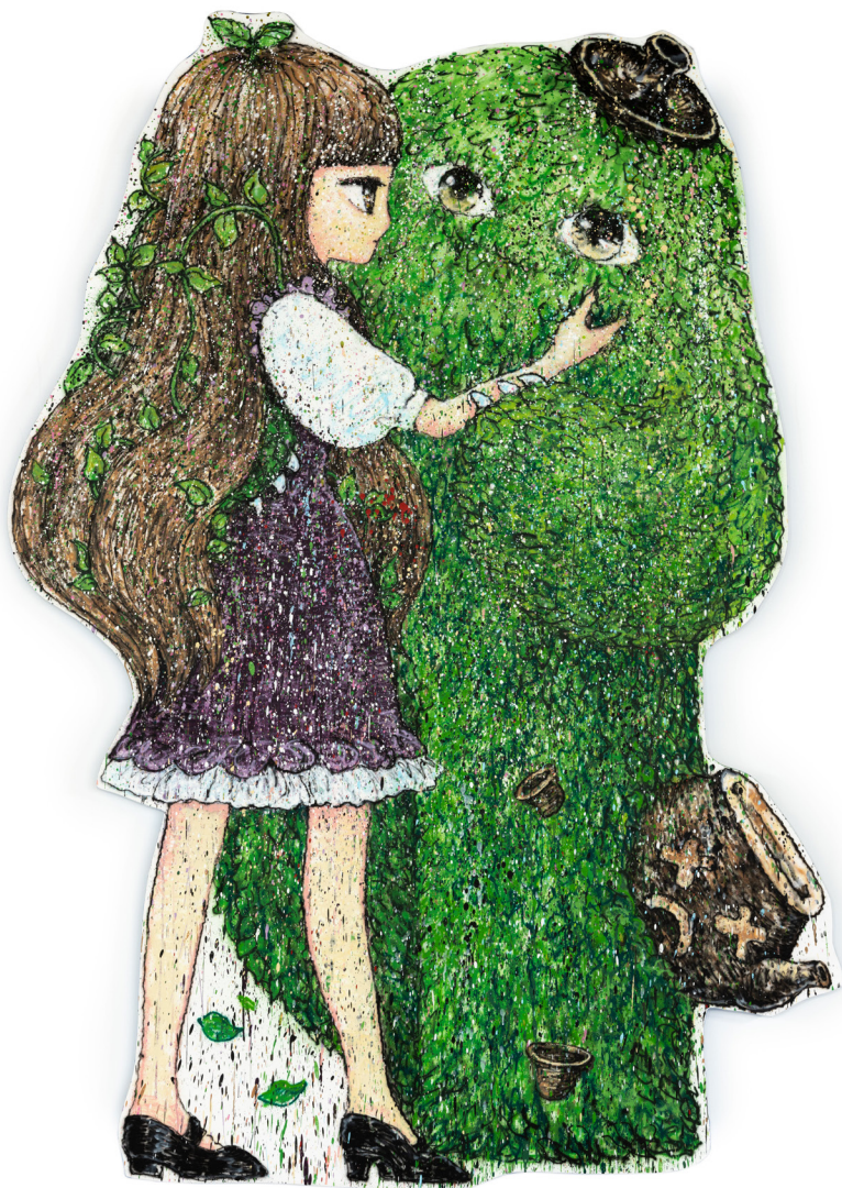
Stickymonger Shall We Dance - Green Tea, 2022 Aerosol paint on shaped canvas 90 x 64 inches