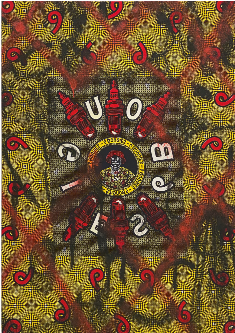
Chito She Always Wins 3, 2022 Spray paint on fabric 43 x 31 inches