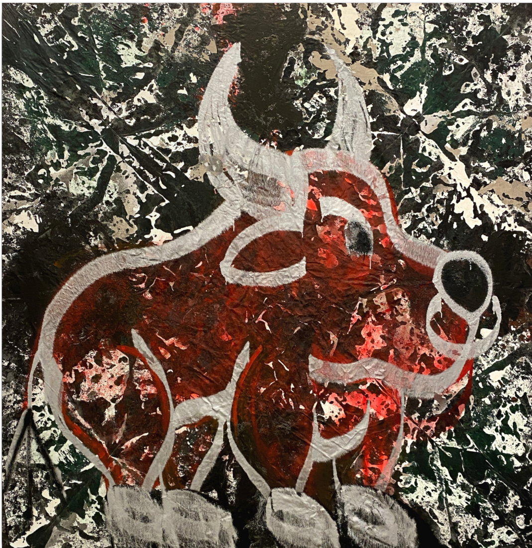
Chito Bull, 2022 Spray paint on fabric 77 x 76.5 inches