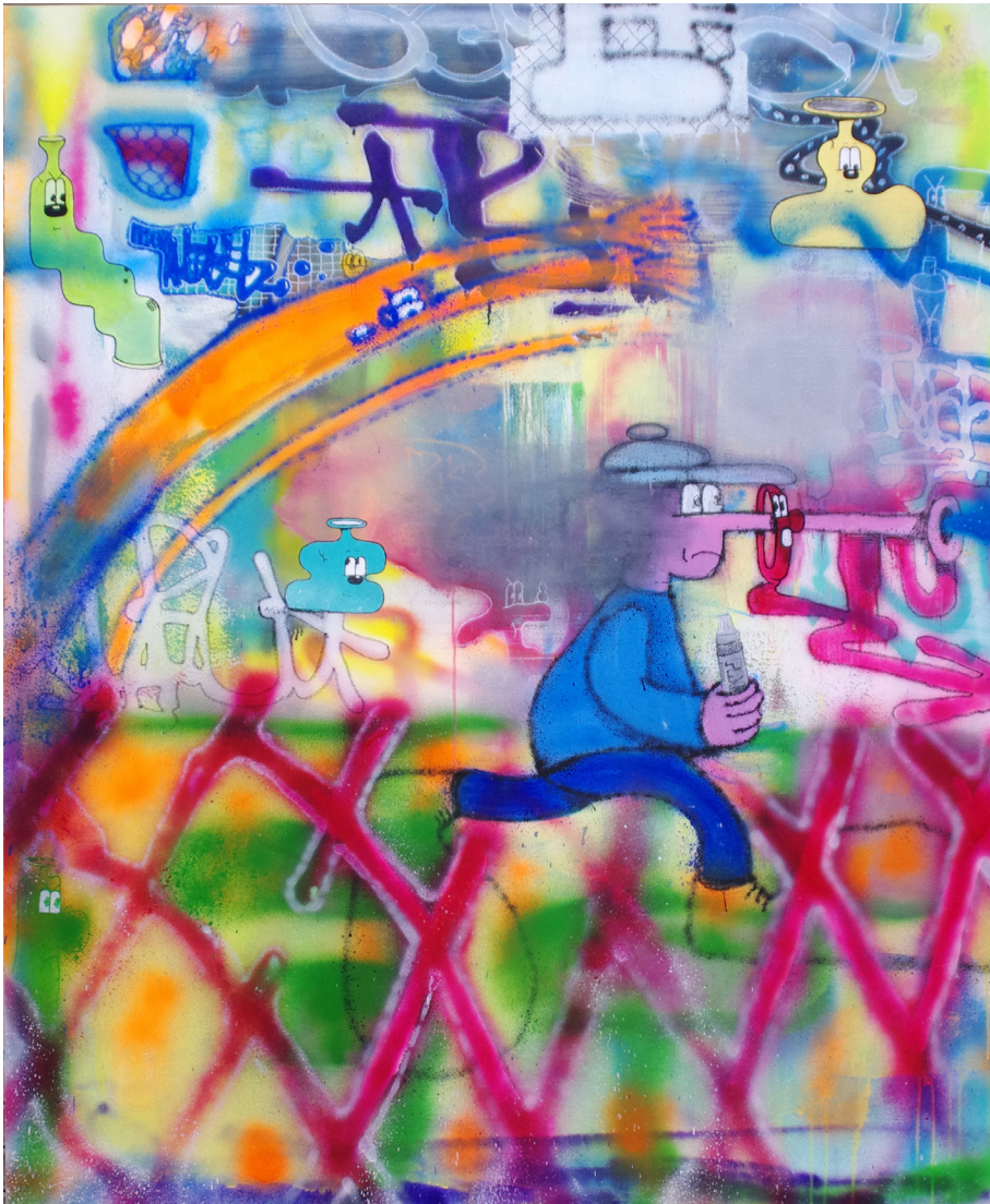
Diego Distorted Day, 2022 Aerosol, acrylic, oil chalk on canvas 63.25 x 51 inches