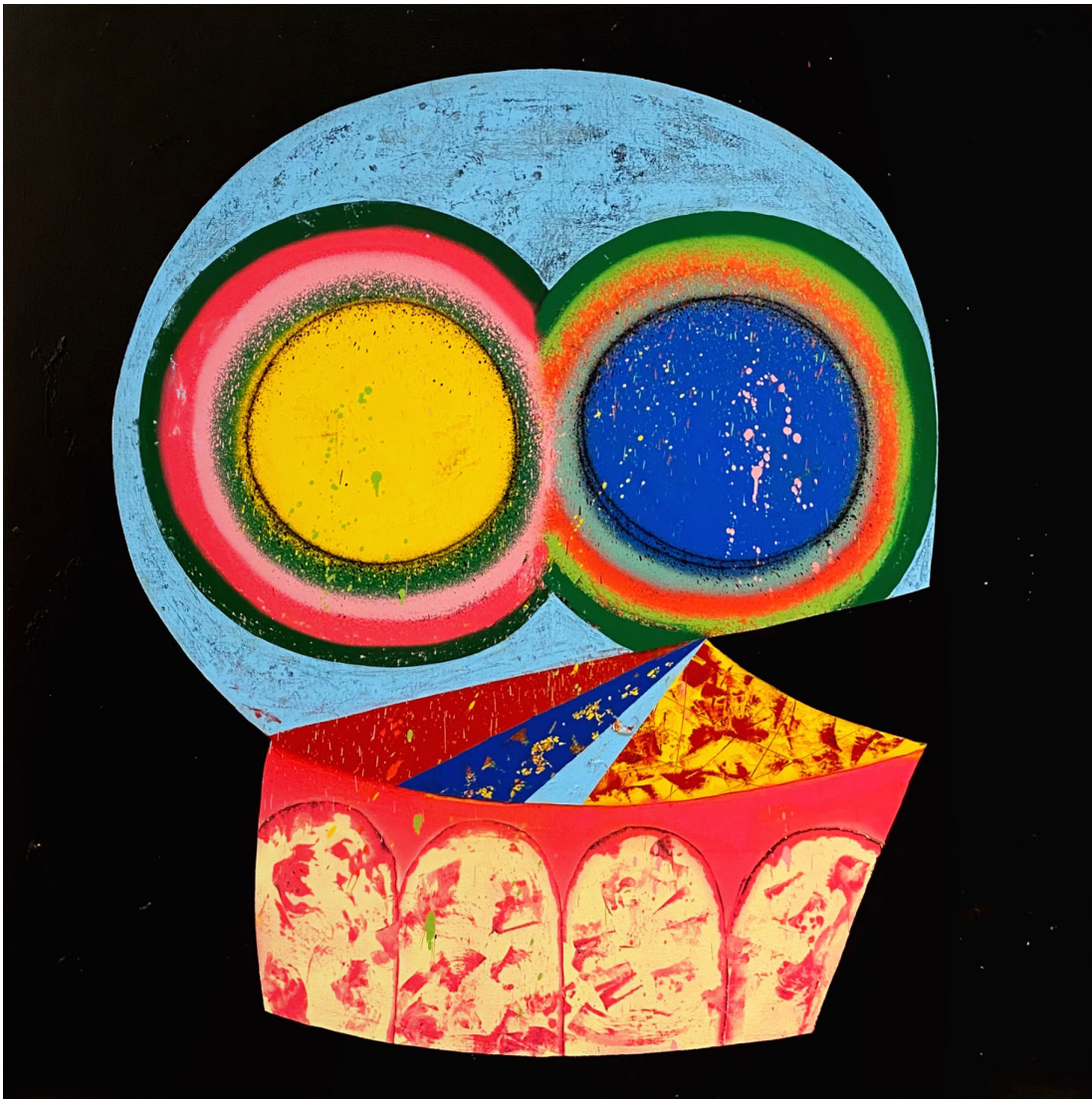
Jonathan Edelhuber Midnight Blues, 2022 Acrylic and spray paint on canvas 48 x 48 inches