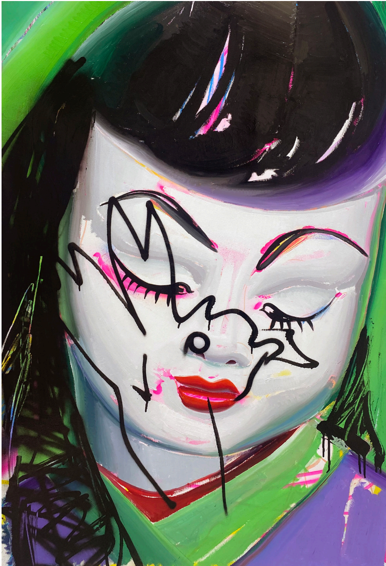
Ana Barriga Nature Boy, 2022 Oil, enamel, marker and spray paint on canvas 48 x 29.75 inches