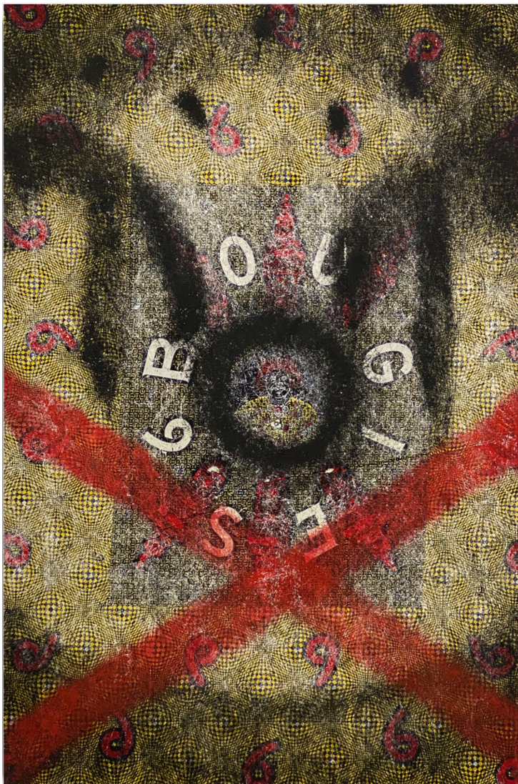
Chito She Always Wins 4, 2022 Spray paint on fabric 43 x 29 inches