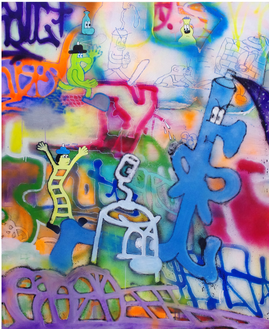
Diego In My Dream, 2022 Aerosol, acrylic, oil chalk on canvas 63.5 x 51.125 inches