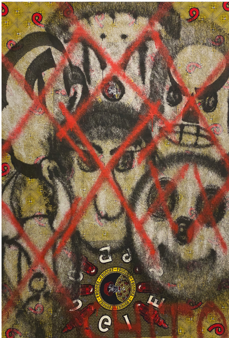
Chito She Always Wins 2, 2022 Spray paint on fabric 61 x 43.1 inches