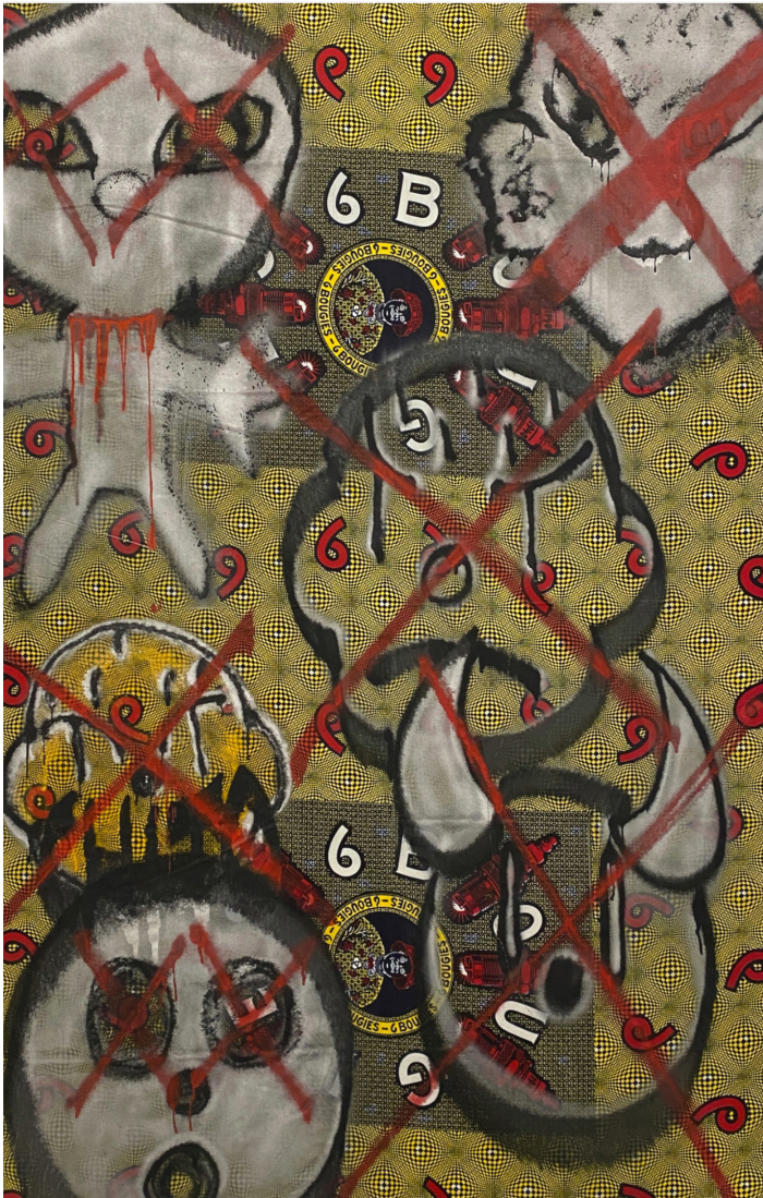
Chito She Always Wins 1, 2022 Spray paint on fabric 66 x 43 inches