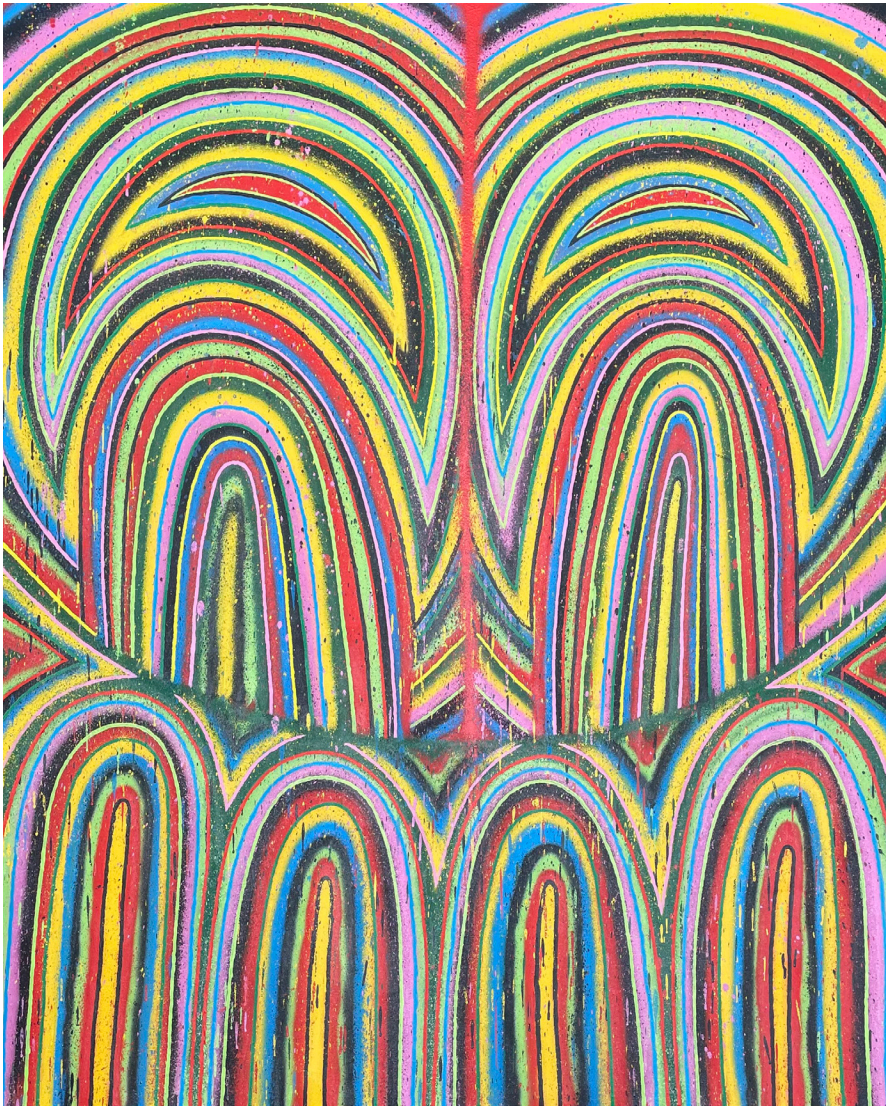
Jonathan Edelhuber I'm Happy That You're Happy, No. 1, 2022 Acrylic and spray paint on canvas 60 x 48 inches