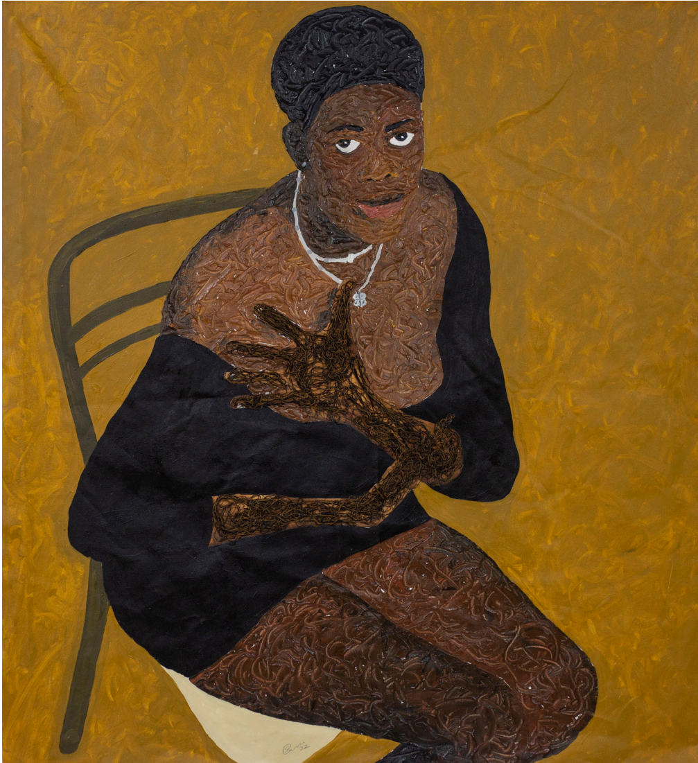
Oscar Quarshie I am Black and I am Bold, 2022 Oil and acrylic on canvas 42 x 39 inches