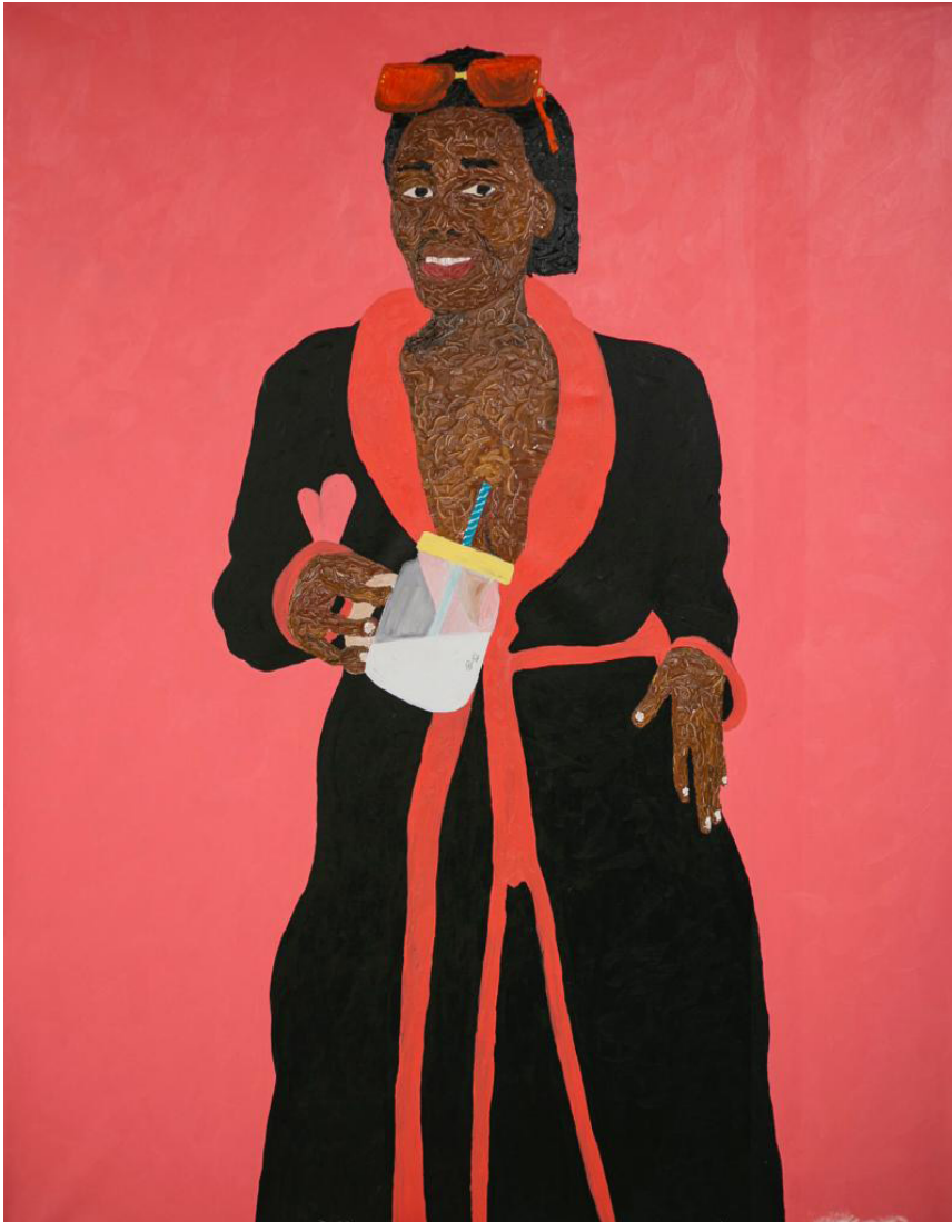
Oscar Quarshie Milkshake, 2022 Oil and acrylic on canvas 68 x 54 inches