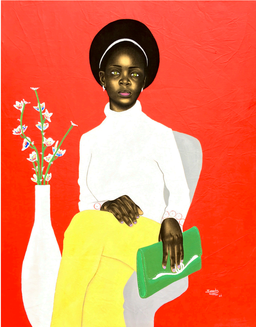
Israel Agboola Oladapo In My Endowment, 2022 Charcoal and acrylic on canvas 60 x 48 inches