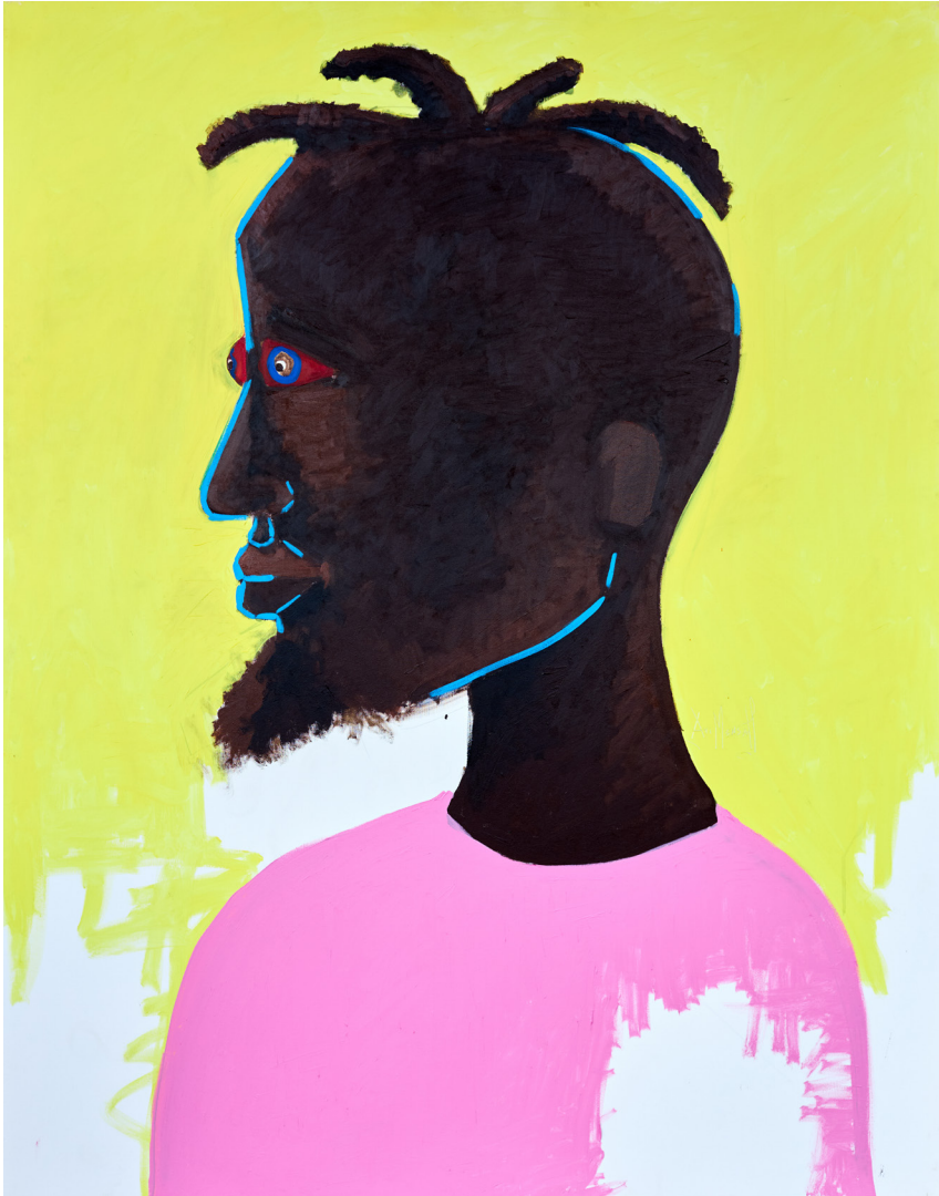
Anthony Ayi Mensah Yitso Pro 15, 2022 Acrylic on canvas 70 x 55 inches