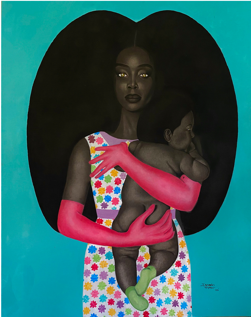
Israel Agboola Oladapo Maami (My Mother), 2022 Charcoal and acrylic on canvas 60 x 48 inches