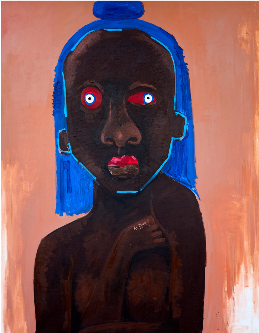
Anthony Ayi Mensah Afia Pony 5, 2022 Acrylic on canvas 70 x 55 inches