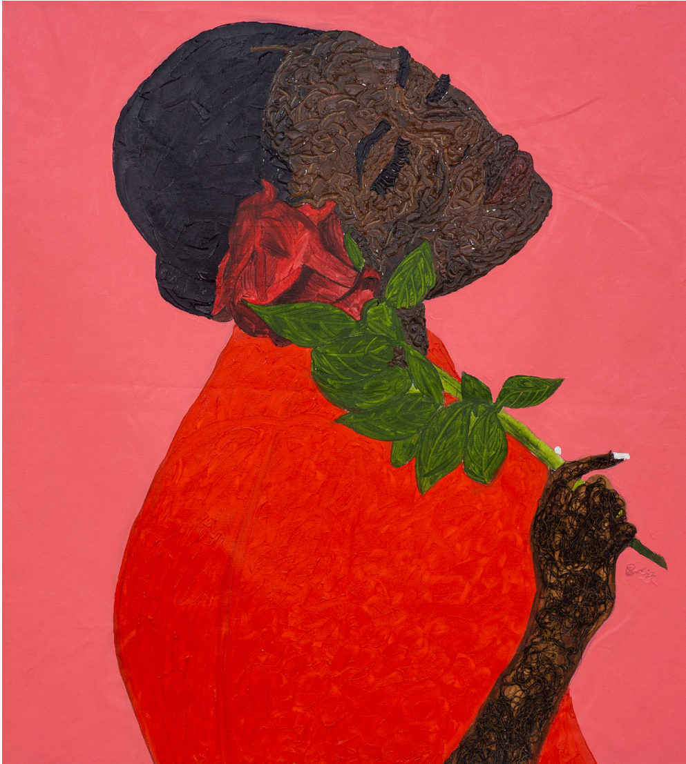
Oscar Quarshie Roses are Red III, 2022 Oil and acrylic on canvas 36 x 33 inches