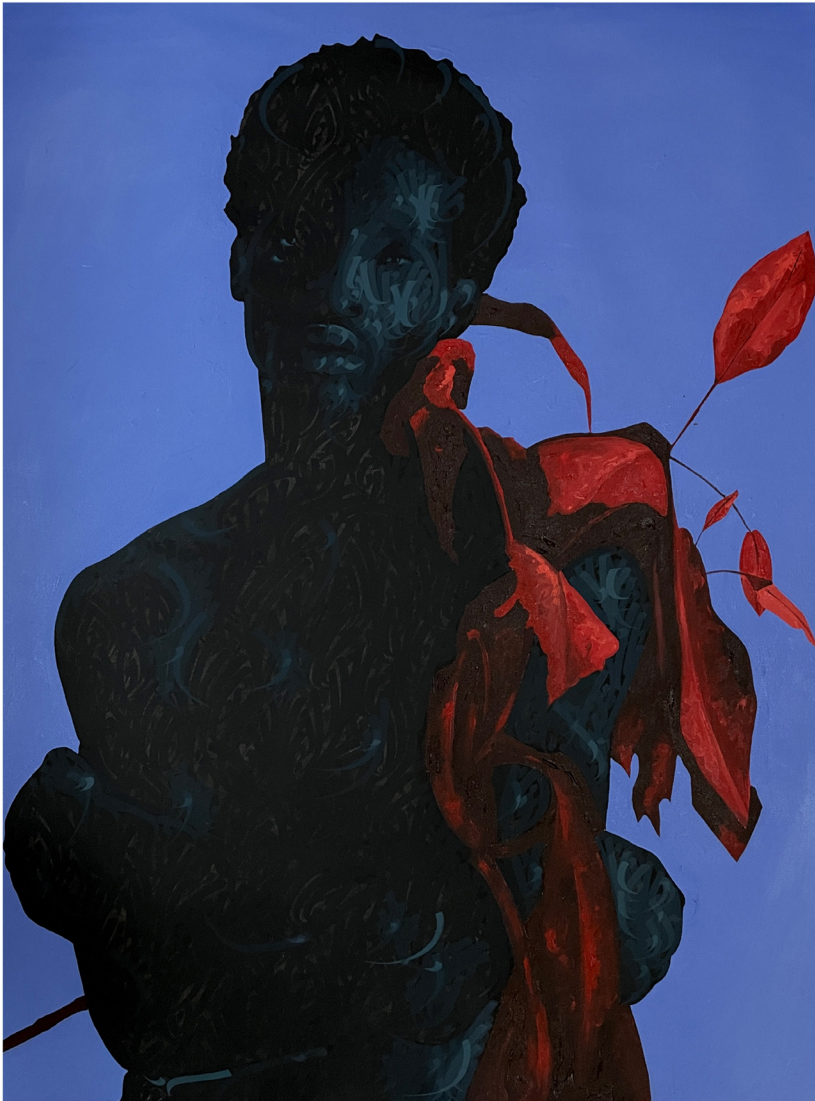
Jimbo Lateef Pretty in Red I, 2022 Acrylic on canvas 40 x 30 inches