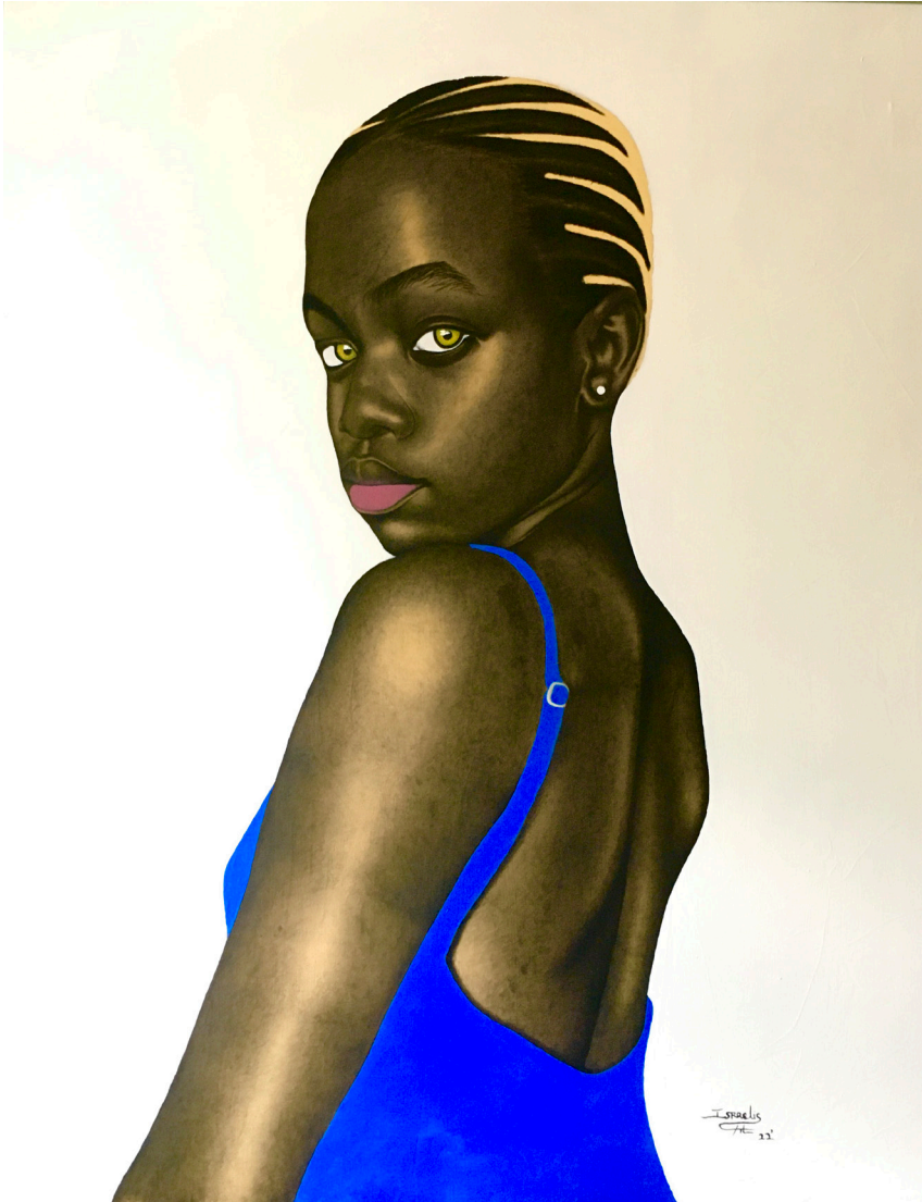
Israel Agboola Oladapo My Solid, 2022 Charcoal and acrylic on canvas 60 x 48 inches