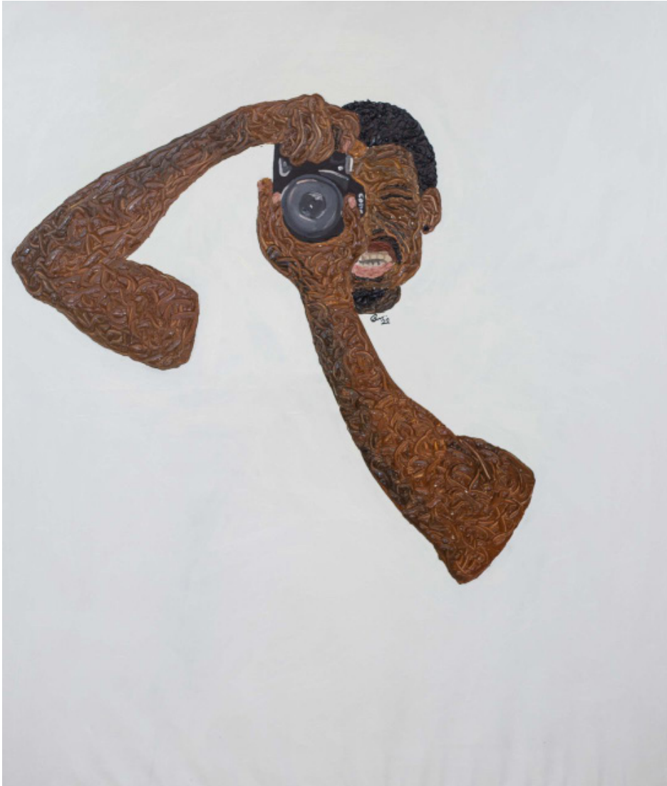
Oscar Quarshie One Shot, 2022 Oil and acrylic on canvas 50 x 45 inches