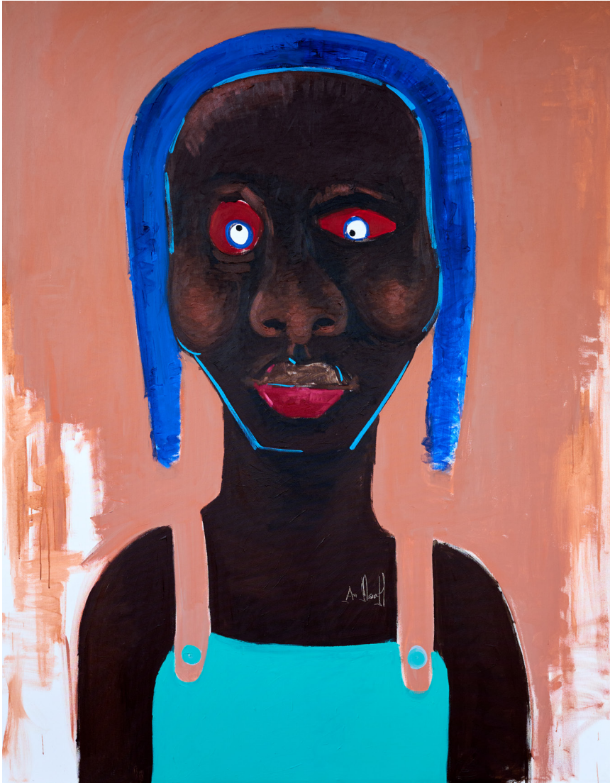
Anthony Ayi Mensah Yitso Agbo 82, 2022 Acrylic on canvas 70 x 55 inches