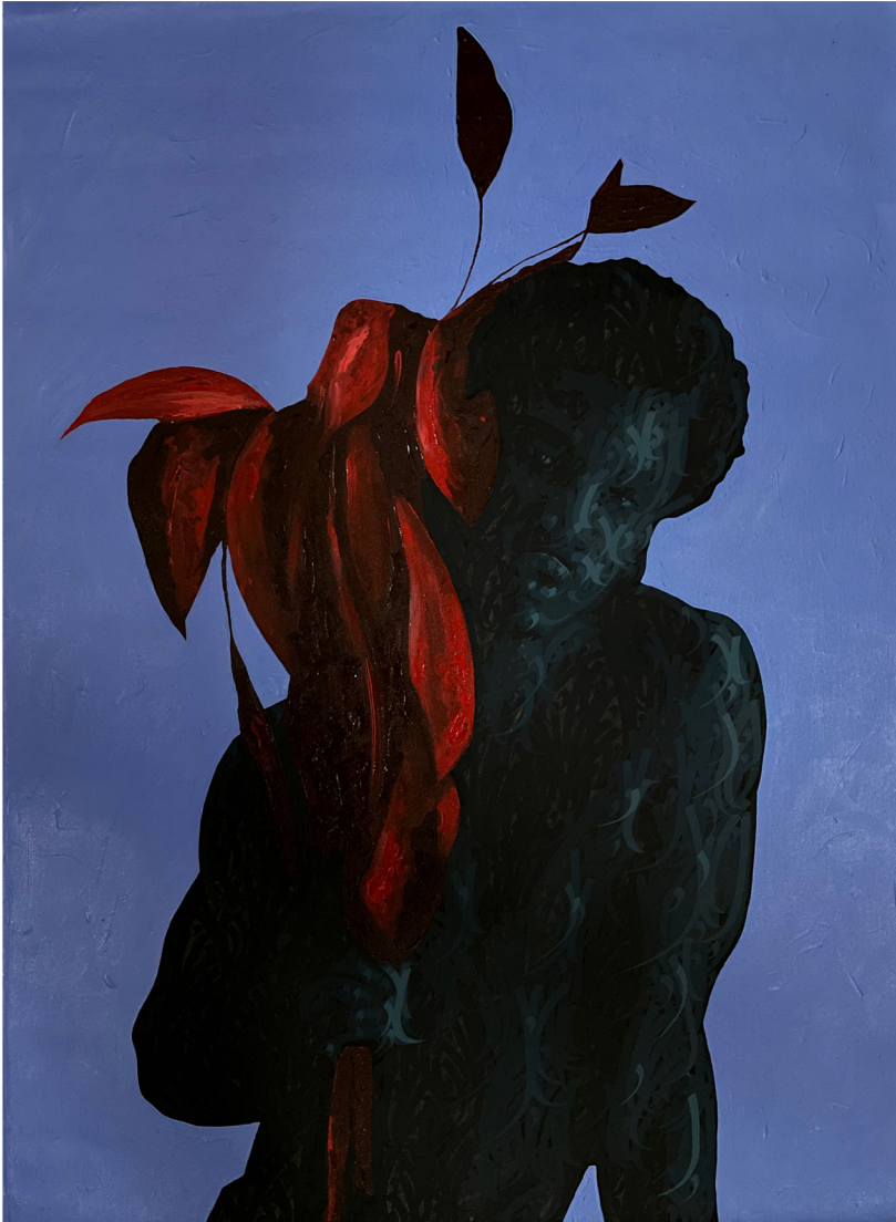
Jimbo Lateef Pretty in Red II, 2022 Acrylic on canvas 40 x 30 inches