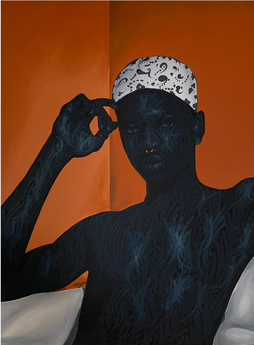
Jimbo Lateef Right Me When Am Wrong, 2022 Acrylic on canvas 40 x 30 inches