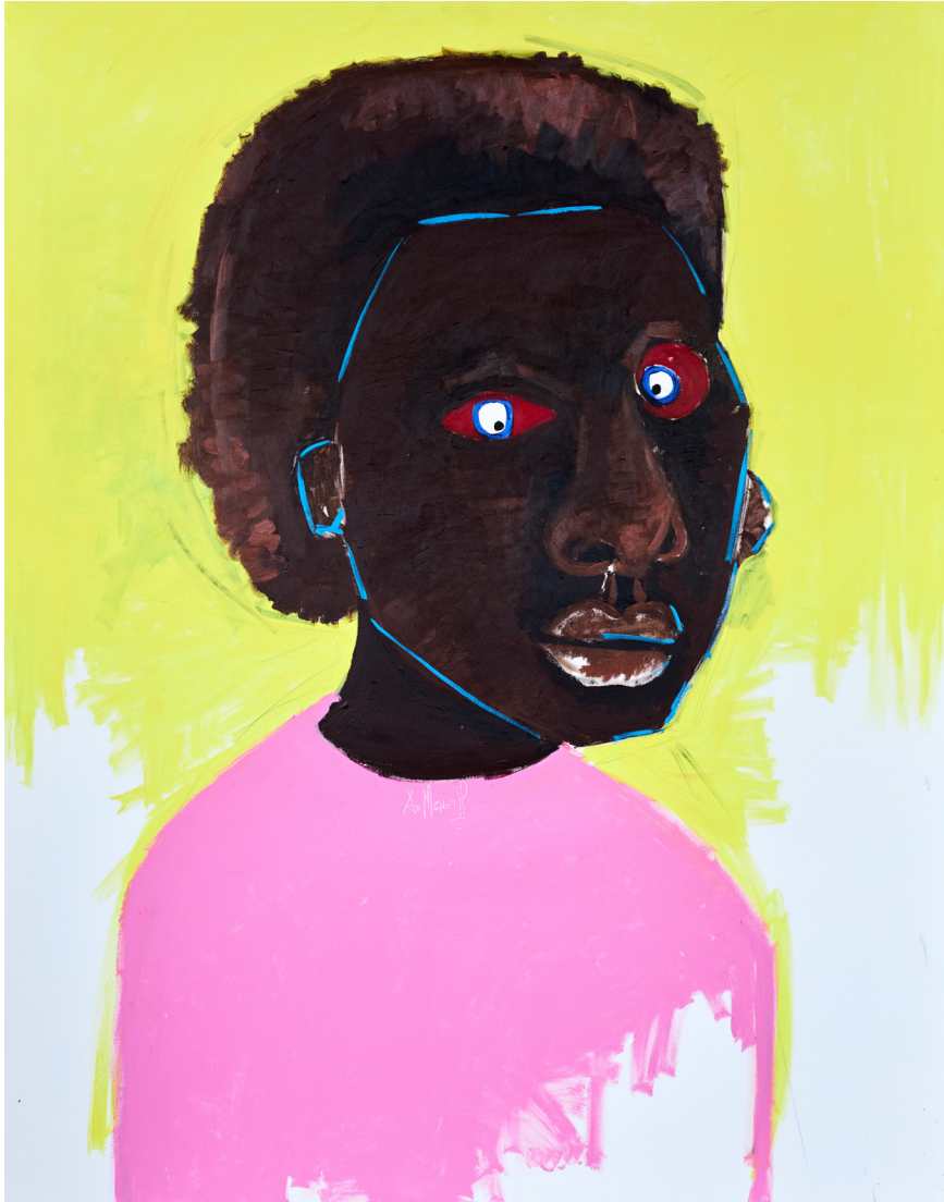
Anthony Ayi Mensah Yitso Agbo 83, 2022 Acrylic on canvas 70 x 55 inches