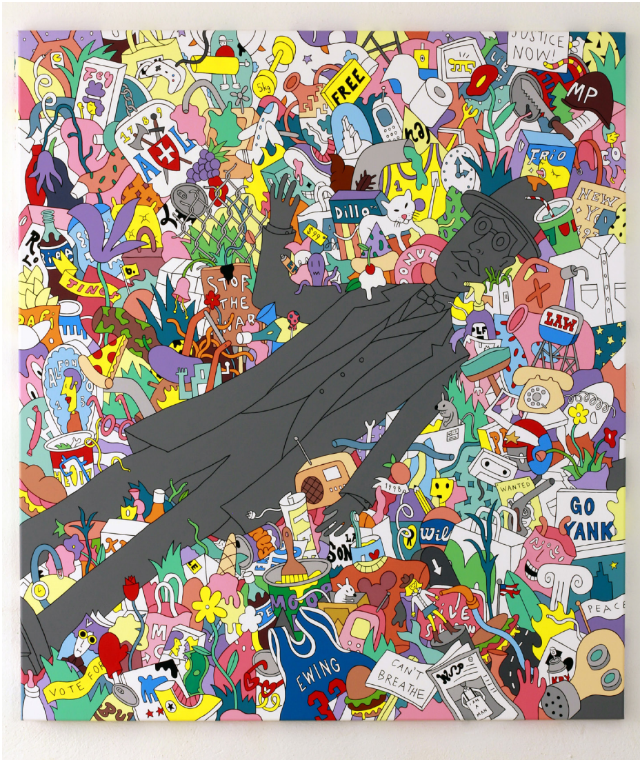
b. New York, 2022 Acrylic on Canvas 63 x 70.9 Inches