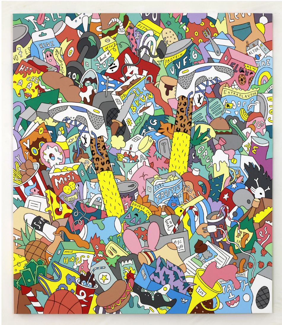
b. Los Angeles, 2022 Acrylic on Canvas 47.2 x 55.1 Inches