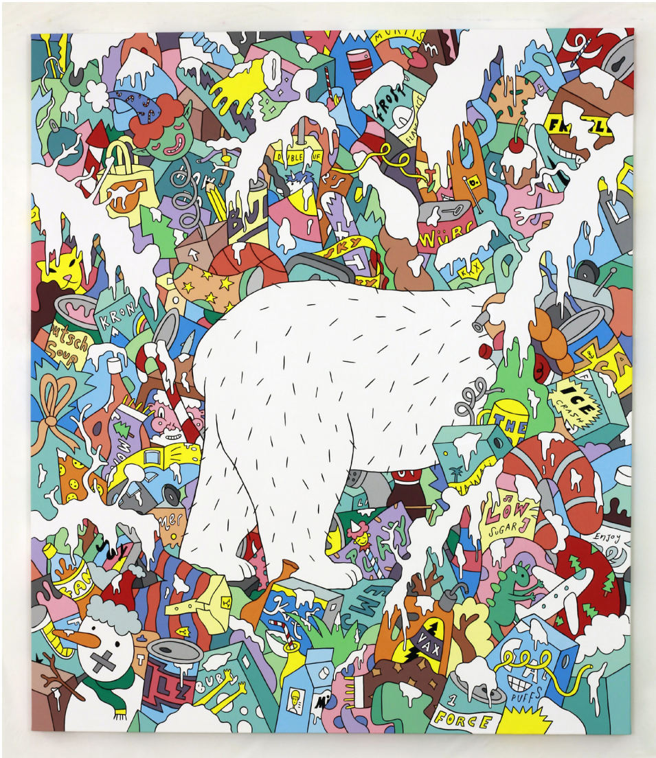
b. North Pole, 2022 Acrylic on Canvas 47.2 x 55.1 Inches