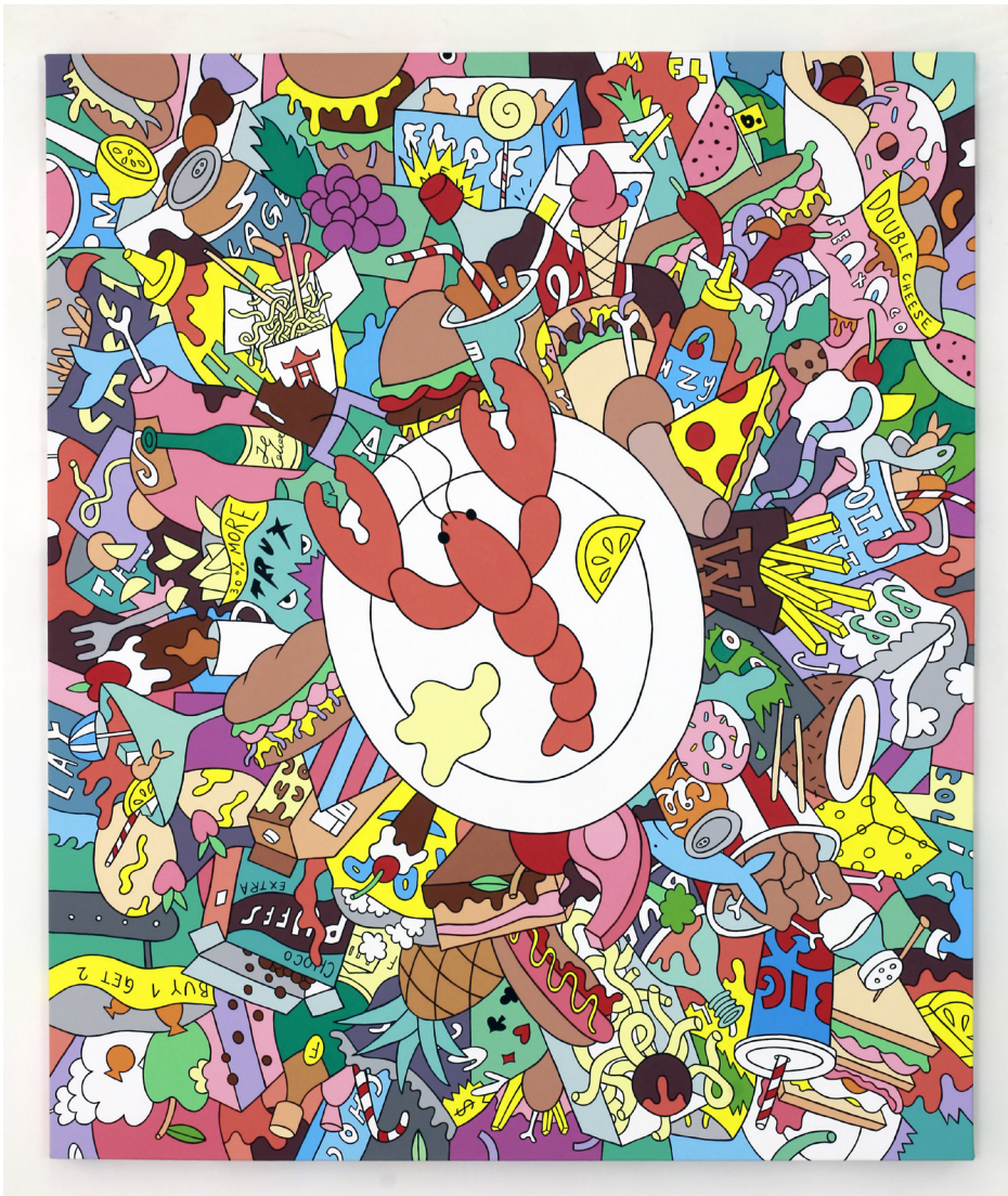
b. Las Vegas, 2022 Acrylic on Canvas 39.4 x 47.2 Inches