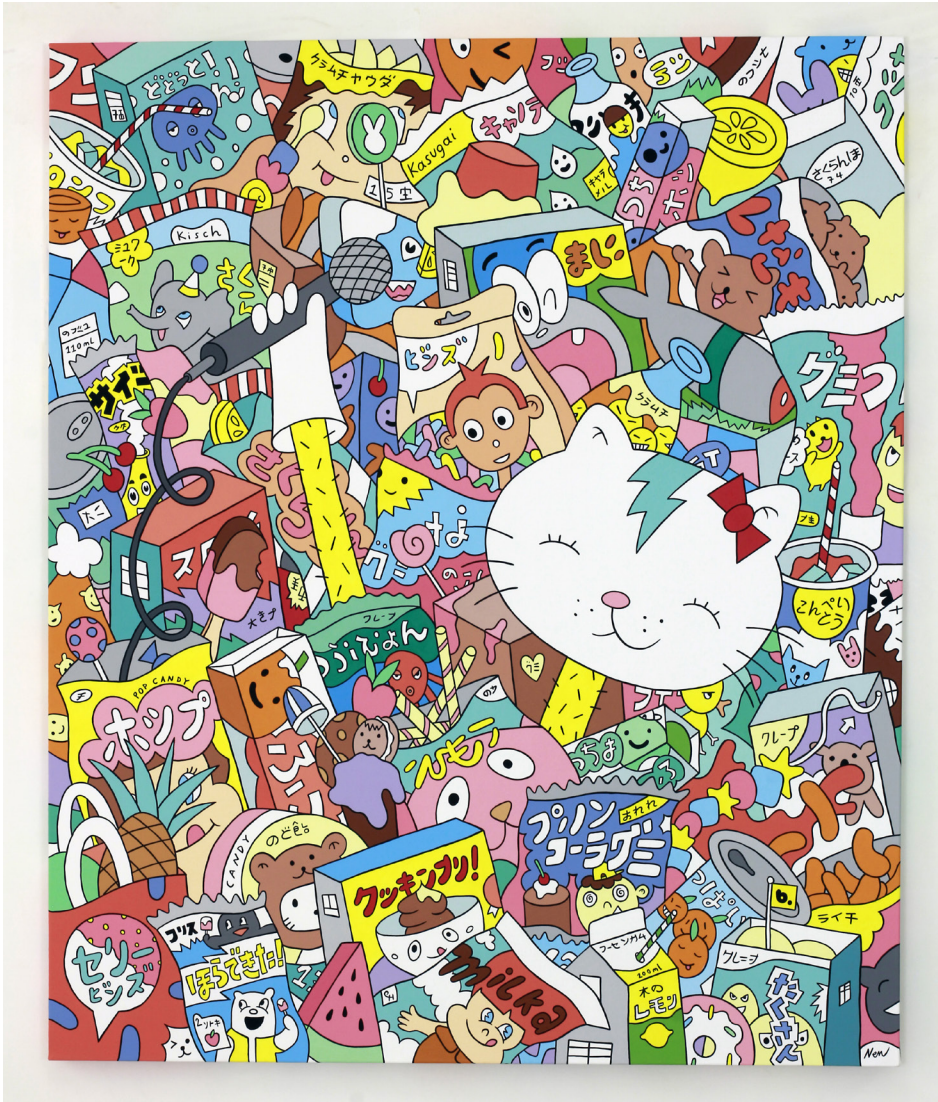
b. Tokyo, 2022 Acrylic on Canvas 39.4 x 47.2 Inches