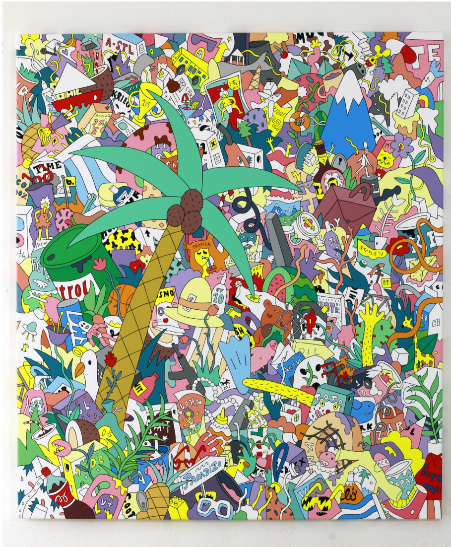
b. Hawaii, 2022 Acrylic Canvas 63 x 70.9 Inches