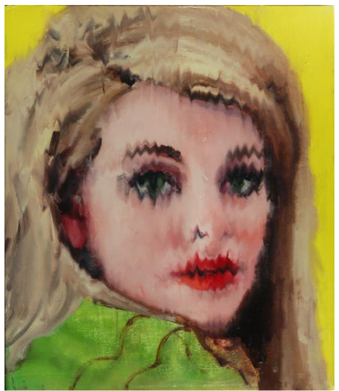
Nathan Ritterpusch, Old Enough to Be My Mother #105, 2019, oil on canvas, 14 x 12 inches

Eric Freeman's use of color and geometry create powerful spatial mirages. His 2-dimensional oil paintings, which can exude a 3-dimensionsal illusory qualities, emerge into brilliant and boundless fields that speak for themselves. Freeman uses color and perspective in the purest form to transcend mono and multi chromatic planes, which invites the viewer to experience both visual and profound emotional depth. "Shelter" and "Blue Room" are examples of how Freeman's work is free of form and symbolism, allowing for singluar focus on the power of color. "Trial" and "Castle" speak to the artists' ability to manipulate color and shade into landscapes of optical illusions. In Freeman's paintings, color is free to grow and vibrate making itself the only subject of the work.