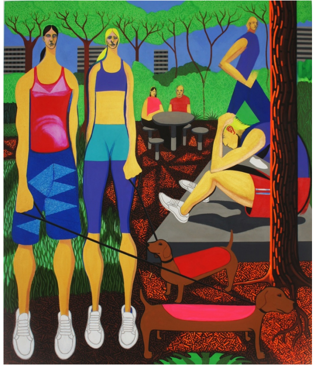
Adam Neate, The Park, 2020

The use of acrylic medium lifts each figurine off the canvas encouraging movement, as well as vibrant color in each "individual" highlighting diversity in this community.