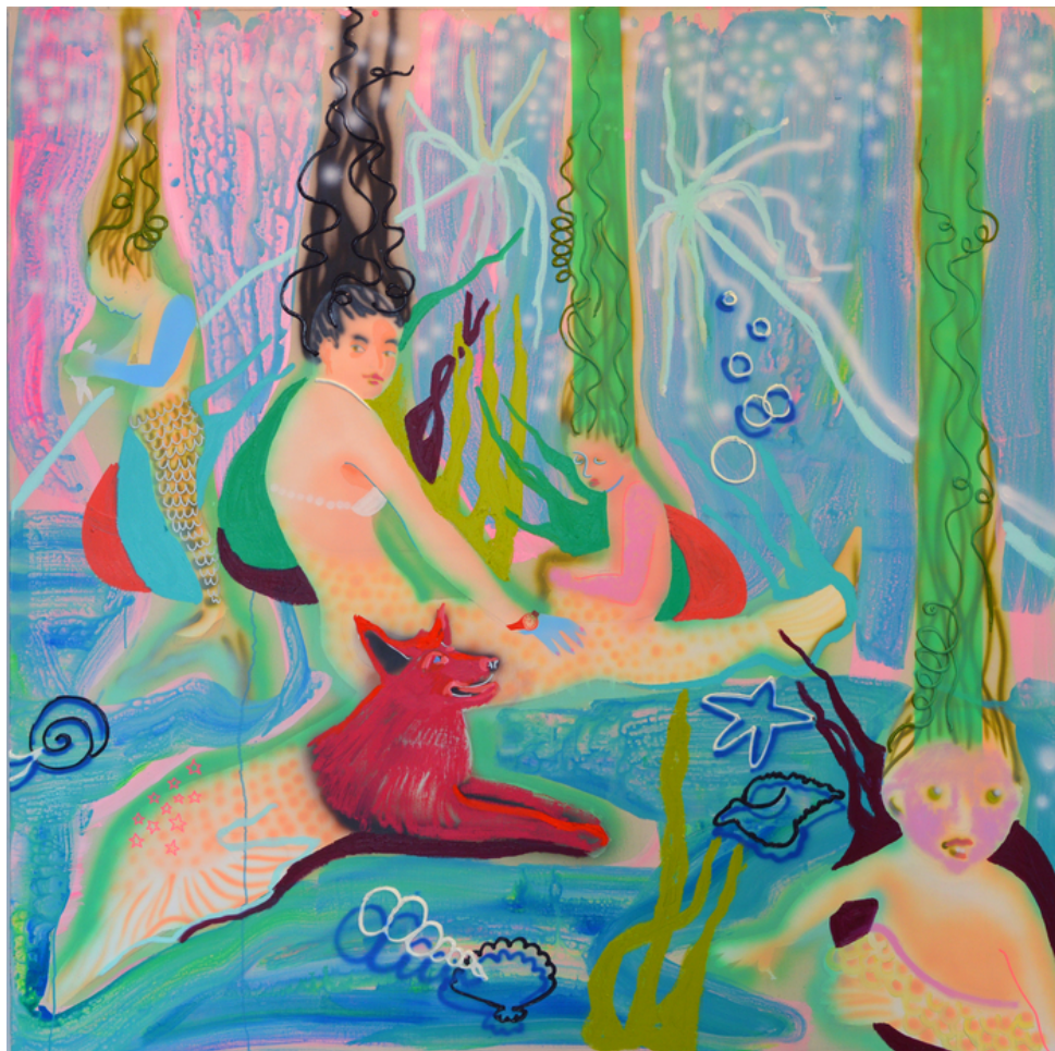
Mermaiding, 2017, acrylic and oil on canvas, 70 x 70 inches

New York, NY – Allouche Gallery is delighted to present "The Breakers", a solo show featuring the works of American artist Emilie Stark-Menneg. Emilie is increasingly recognized for her powerful technique, as well her refreshingly bright and playful aesthetic. The exhibition will be on view at Allouche Gallery starting on Saturday January 6. Emilie's work will also be exhibited as part of a group installation at Allouche Gallery's booth at Untitled, Art Fair San Francisco from January 12 - 14.