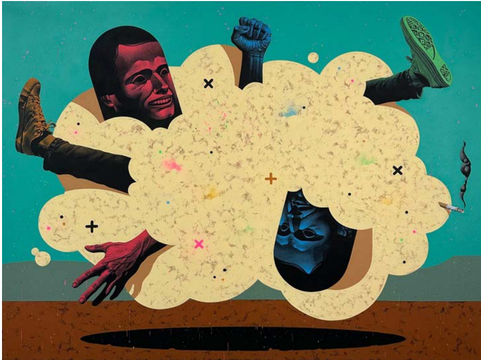
Michael Reeder. Mental Melee , 2023. Acrylic, spray paint on canvas. 72 x 96".

The introspective quality of the collection allows for a refreshing interpretation of the different elements of Reeder's creative process- from him battling creative struggles to taking inventory of the different inspirations that give way to his creations. In his showpiece work, "Mental Melee", opposing figures battle each other as Reeder depicts the internal conflict of indecisive thinking. Mirrored figures kick and grab for each other for dominance in a cloud of thought.