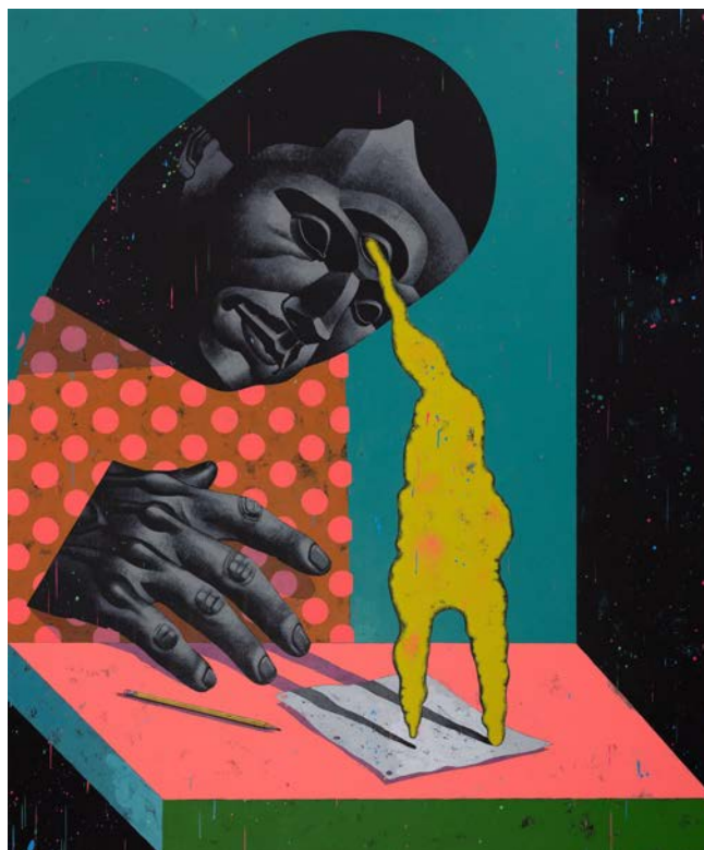
Michael Reeder. Brain Fart , 2023. Acrylic, spray paint on canvas. 72 x 60".

This collection of new works comprises works on canvas or linen in addition to his traditional shaped and layered wood works. This exploration of medium has given way to the figures themselves becoming rendered in incredible detail. The depth and structure of his wood works provide a lively physicality, while the flatness of canvas has allowed for the further development of Reeder's imagery.