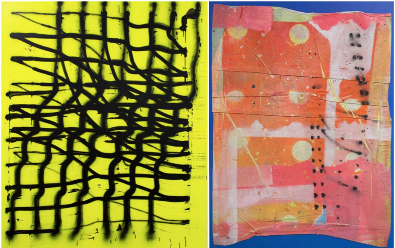
Left: REVOK, Instrument Exercise 2 Black/Yellow , 2016, Acrylic and synthetic polymer on canvas, 72 x 60 inches Right: REVOK, Self Portrait 2 Aug Vov , 2016, Synthetic polymer and oil enamel on linen drop cloth mounted to canvas, 96 x 72 inches

"Self Portraits" are another one of REVOK's structurally recognizable elements. The artist up-cycles the industrial drop cloths that once covered the floor of his art studio collecting mixed media from his projects over the months or years. He mounts each of the vibrant cloths onto a unicolor canvas. These works represent the artists' artistic processes over time in an intimate and genuine manner.