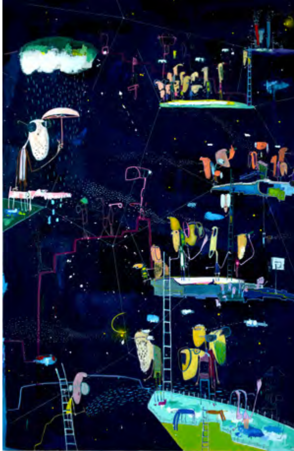
Rafa Macarrón, Cuidados del Sustento , 2016, mixed media on aluminum, 89 x 57.5 inches