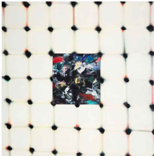
Ross Bleckner. Mausoleum , 2017. Oil on linen. 60 x 60 inches.

From Ross Bleckner, whose famous works reflect on mortality and the ephemeral nature of life, to FAILE's distinct approach merging street art and pop culture, 'ABSTRACTIVE' encompasses a diverse representation of abstraction. Classical meets grit through showing the manifolds of non-representational art.