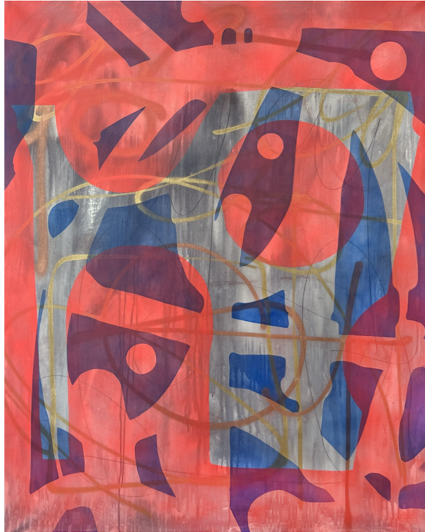
JM Rizzi. Subconscious Drag , 2023. Oil, acrylic, and spray paint on canvas. 66 x 52 inches.

Artists such as FAILE, JM Rizzi, and Revok highlight how roots in street art and graffiti can lend to gestural abstraction. Color and movement breathe life into these vibrant works from artists that represent both street and classical art. Combinations of color and texture allow for the movement and vibrancy of the paint to buzz with an energy nostalgic of graffiti.