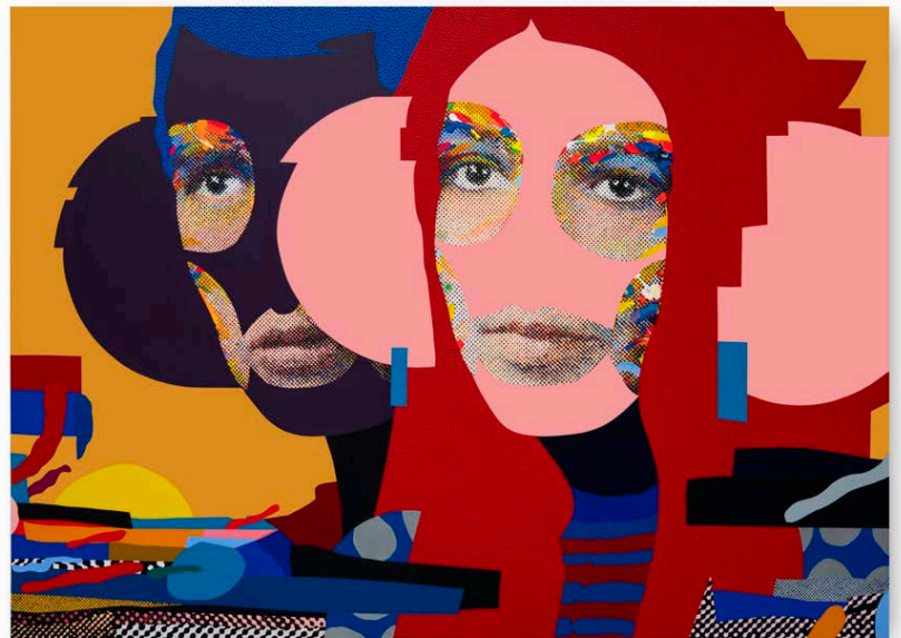
Understanding our new place