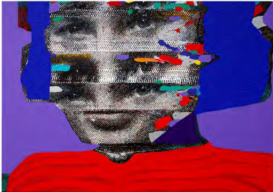
False as Dreams

Join us at the Allouche Gallery, NYC for the opening reception of “Seeyou” Thursday November 9th from 6:00 to 9:00 pm - 77 Mercer Street.