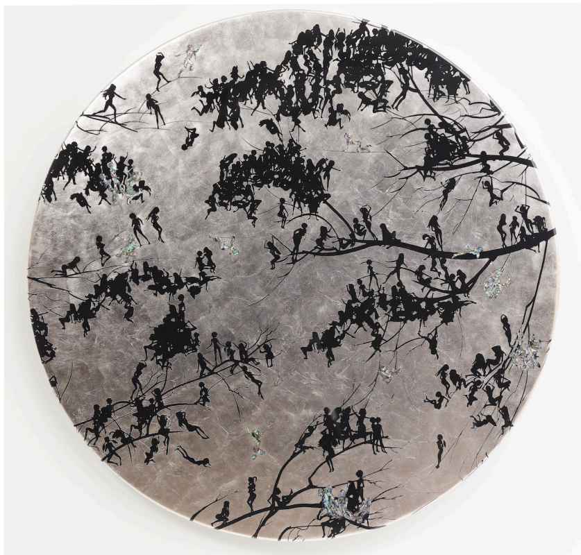
Aurora, 2018. Palladium leaf, resin, and shell on wood panel. 46 x 46 x 3 inches.