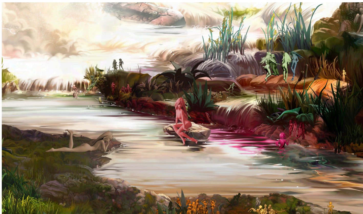
Detail photo of Naiad Water Nymphs, 2024. C-print on plexiglass with wood frame. 81.5 x 57.5 inches.