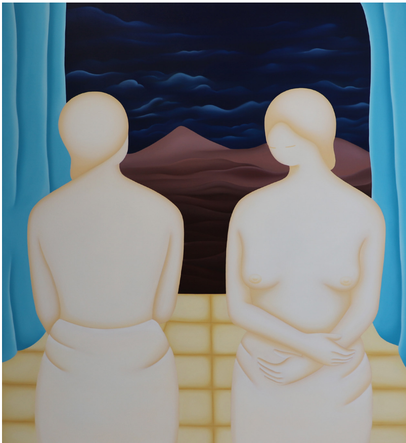
Parellel Existence, 2024. Oil on canvas, 59 x 55 in.