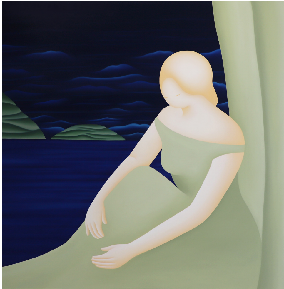
After Dark Reverie, 2024. Oil on canvas, 55 x 55 in. © Anaja Hvastija Gaia. Courtesy of Allouche Gallery and the Artist.