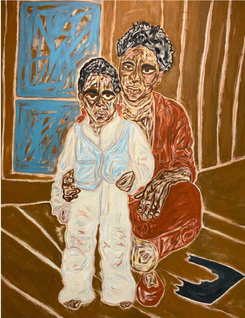
Sissòn Selene, 2024 Acrylic and charcoal on cotton canvas 64 x 50 inches