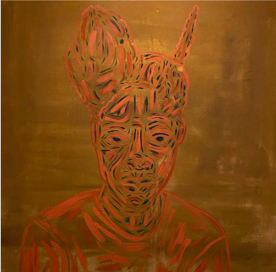
Sissòn Oshun, 2024 Acrylic and charcoal on cotton canvas 44 x 46 inches