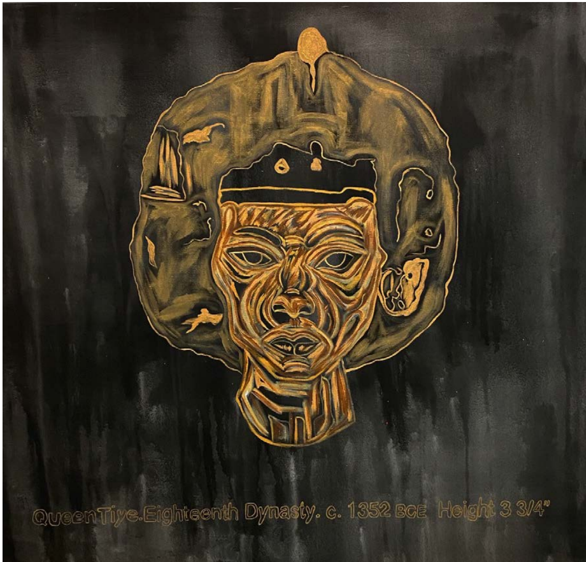
Sissòn Tiye, 2024 Acrylic and charcoal on cotton canvas 68 x 72 inches