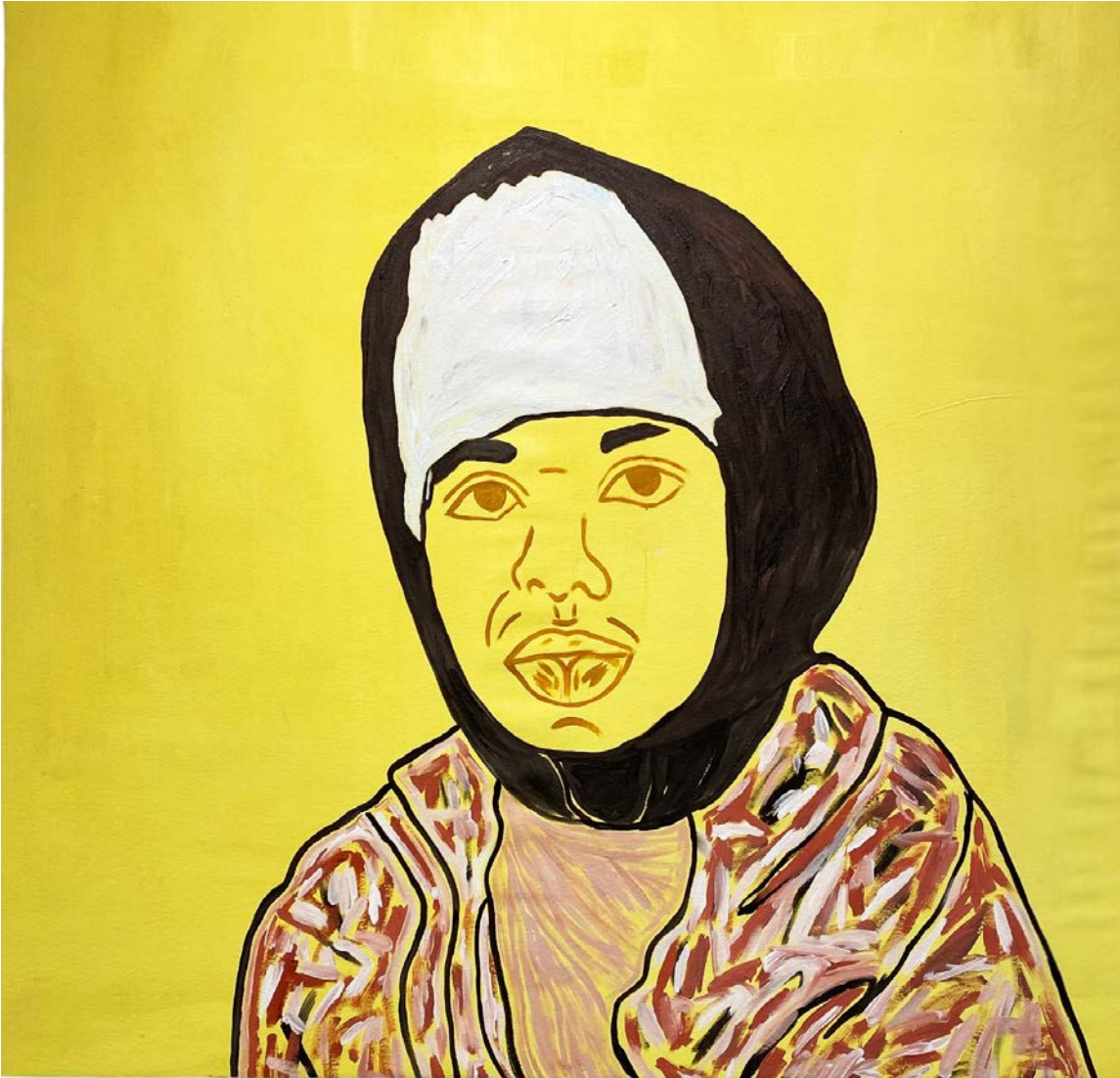
Sissòn Emahoy, 2024 Acrylic and charcoal on cotton canvas 44 x 46 inches