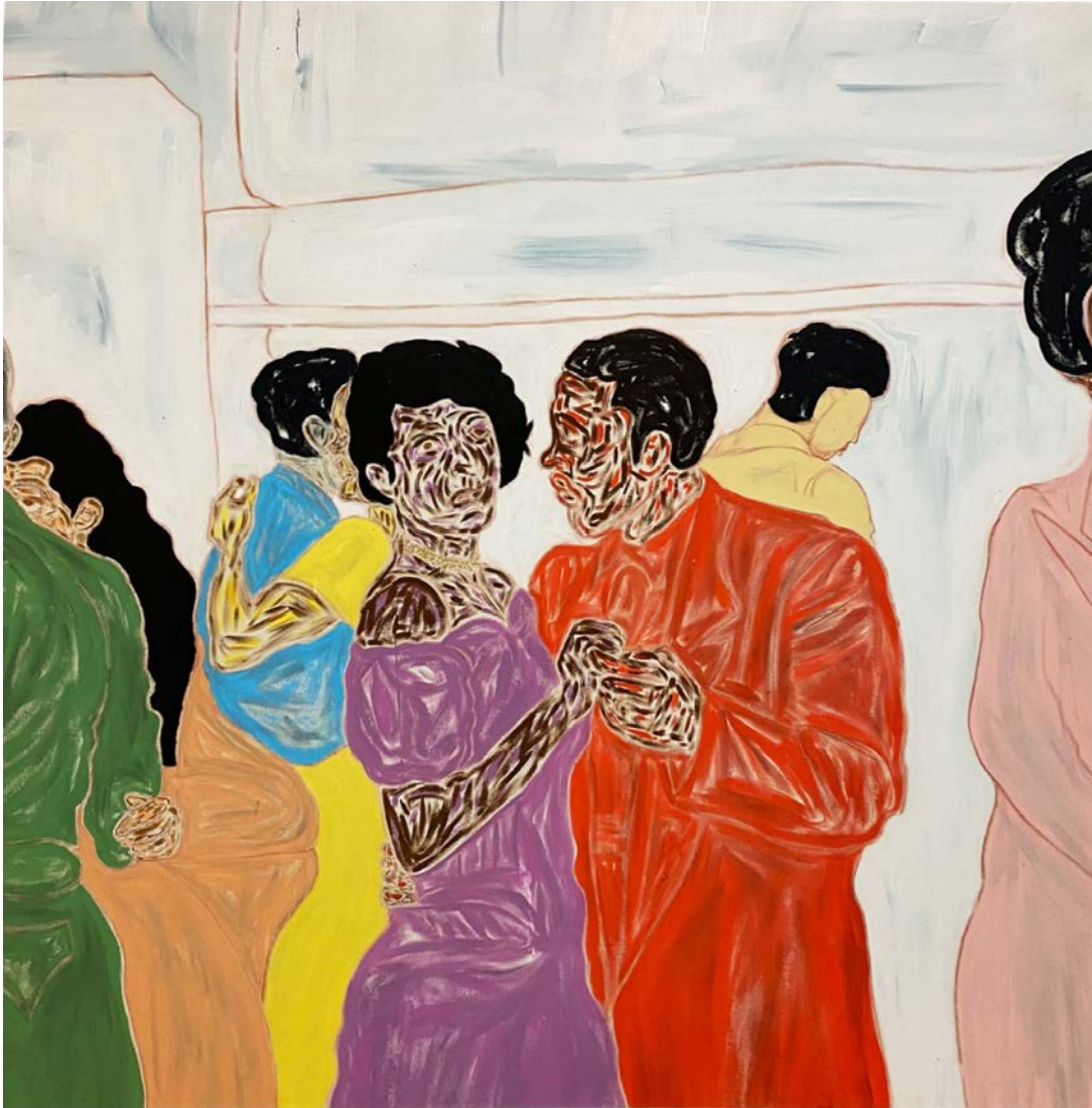
Sissòn Annie, 2024 Acrylic and charcoal on cotton canvas 62 x 62 inches