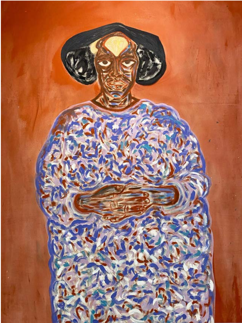
Sissòn Nana, 2024 Acrylic and charcoal on cotton canvas 66 x 50 inches