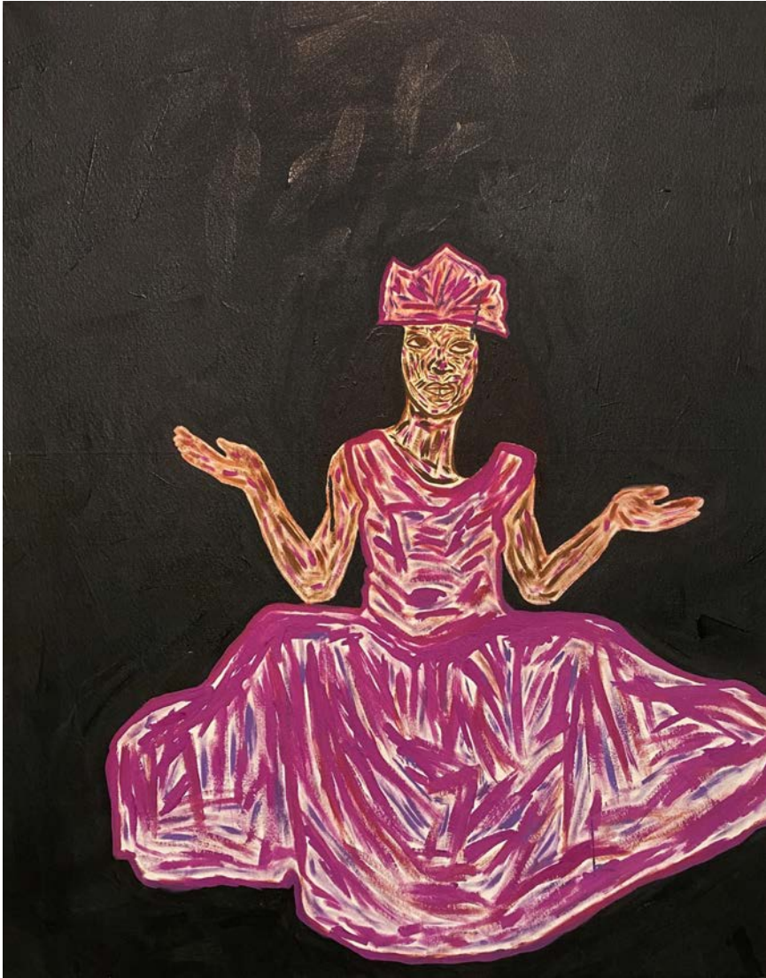
Sissòn Melody, 2024 Acrylic and charcoal on cotton canvas 42 x 33 inches