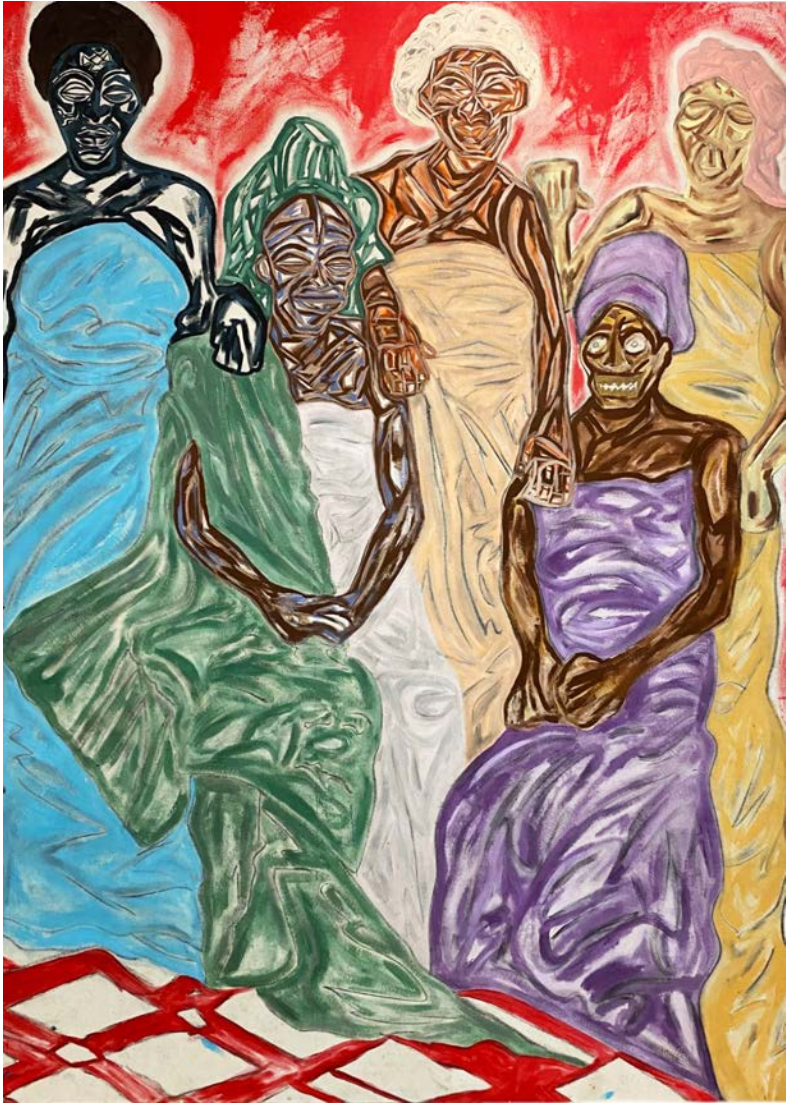
Sissòn Yemaja, 2023 Acrylic and charcoal on cotton canvas 84 x 60 inches