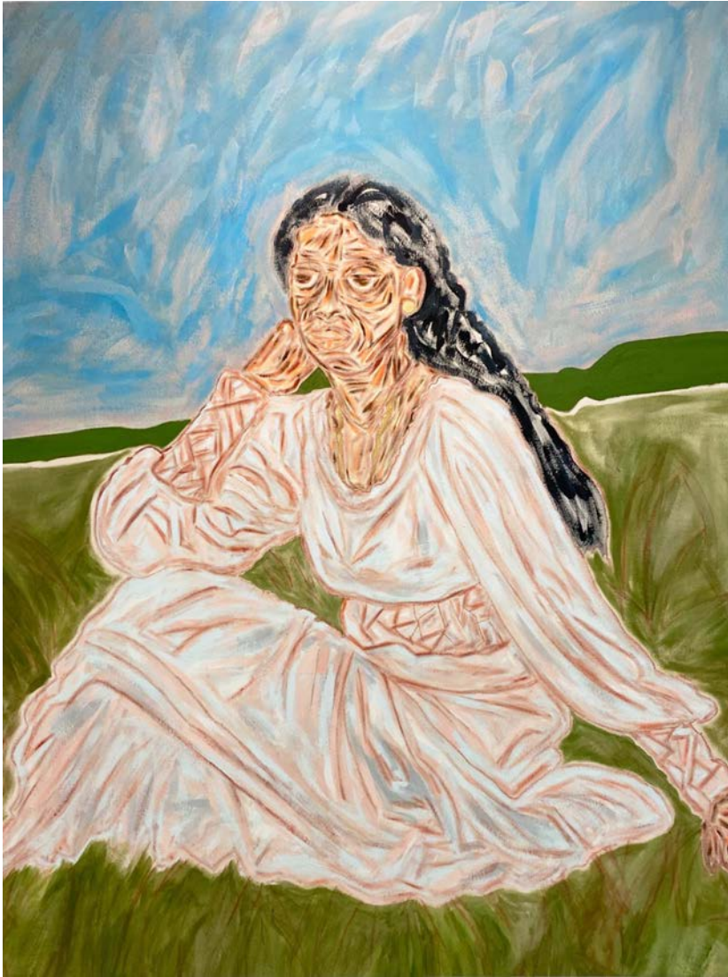
Sissòn Barbara, 2024 Acrylic and charcoal on cotton canvas 64 x 48 inches