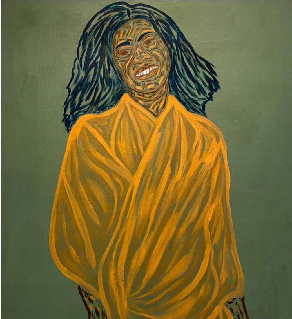
Sissòn Alice, 2024 Acrylic and charcoal on cotton canvas 35 x 32 inches