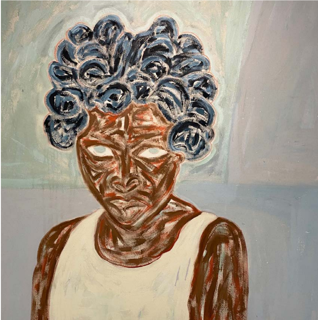
Sissòn Inà, 2024 Acrylic and charcoal on cotton canvas 46 x 46 inches