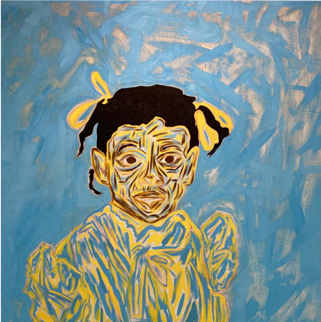
Sissò Momma, 2024 Acrylic and charcoal on cotton canvas 46 x 46 inches