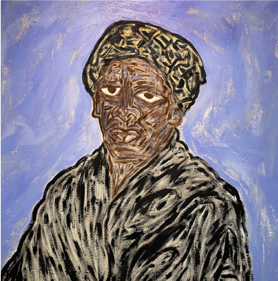
Sissòn Harriet, 2024 Acrylic and charcoal on cotton canvas 46 x 46 inches