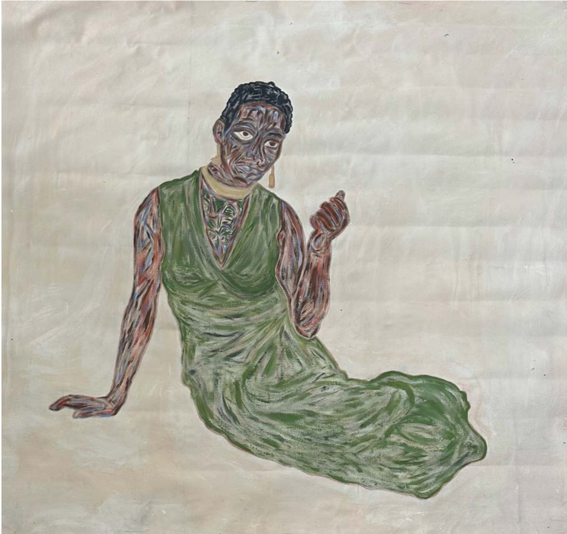
Sissòn Nina, 2024 Acrylic and charcoal on cotton canvas 72 x 76 inches