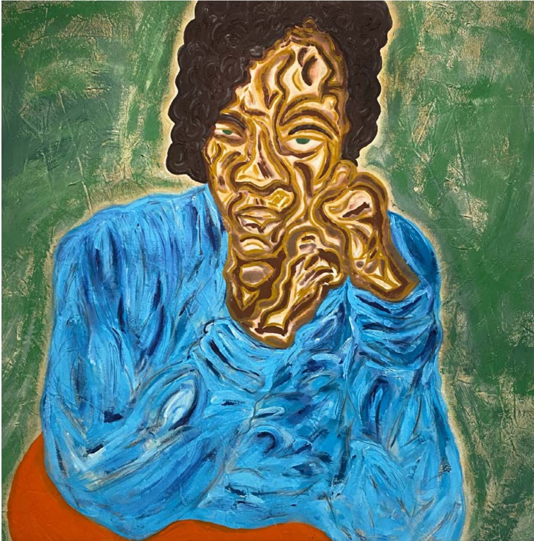
Sissòn Kiki, 2023 Acrylic and charcoal on cotton canvas 46 x 46 inches