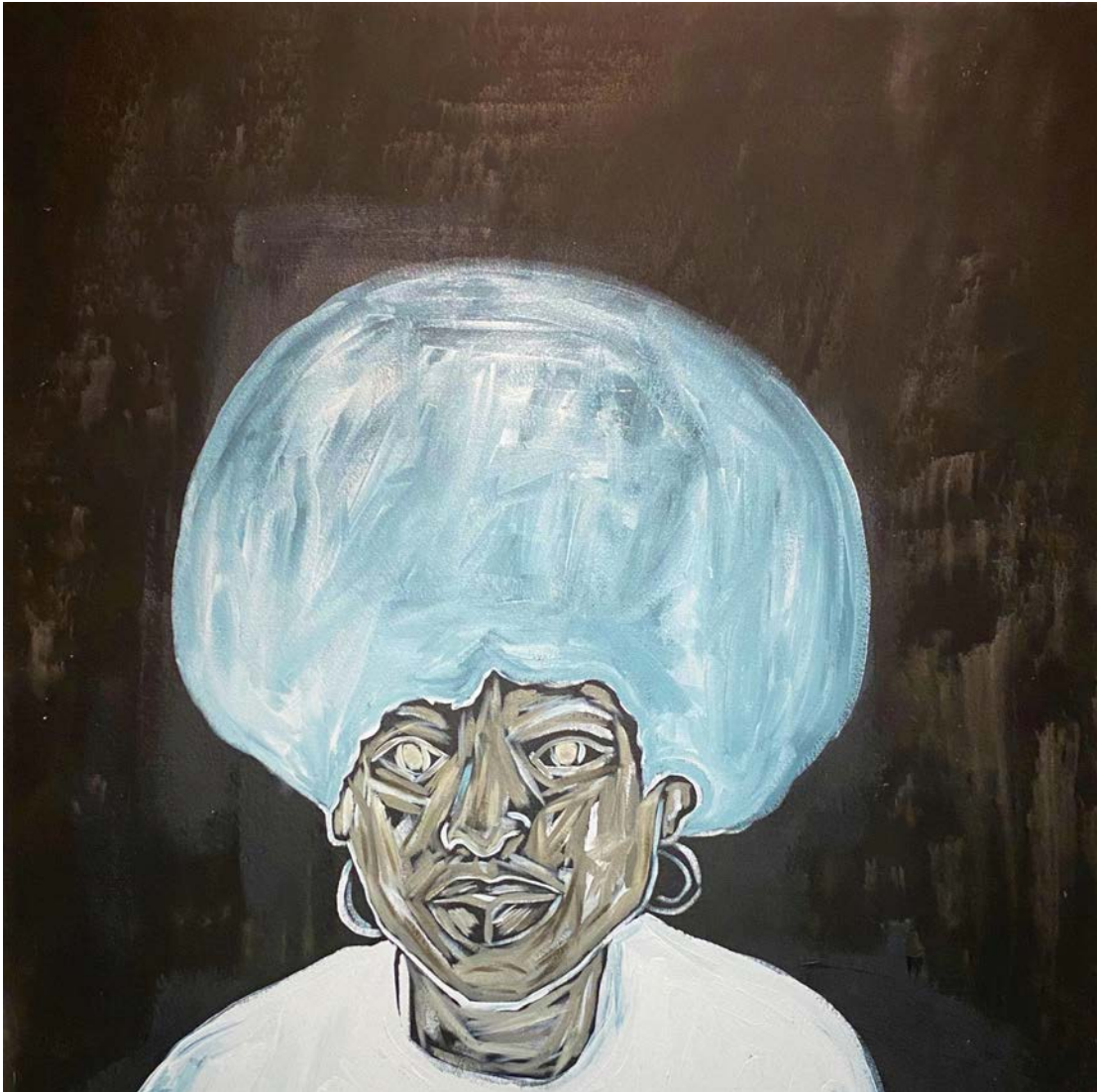
Sissòn Assata, 2024 Acrylic and charcoal on cotton canvas 44 x 44 inches