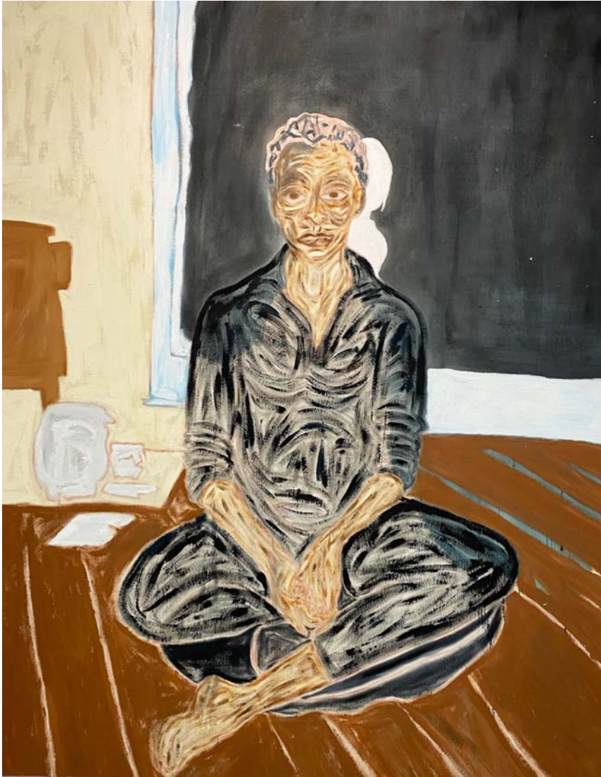
Sissòn Kara, 2024 Acrylic and charcoal on cotton canvas 64 x 50 inches