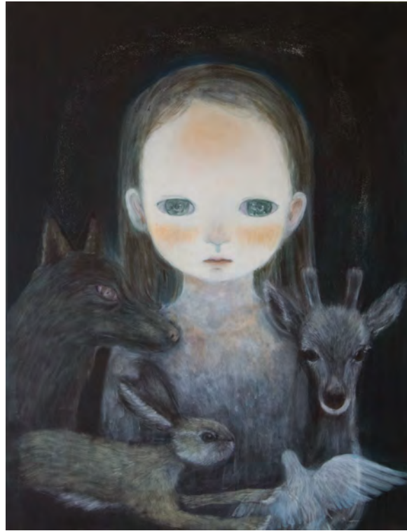
Ruo-Hsin Wu. Song of the Night, 2024 Acrylic on canvas. 36 x 28 inches

Tilt's (Toulouse, France) work captures the dynamic energy of urban landscapes, merging graffiti and street art aesthetics with gestural painting. His works, exhibited in notable museums like the Les Abattoirs Museum in Toulouse and the The Mohammed VI Museum of Modern and Contemporary Art in Morocco, explore the magic of shared space through vibrant abstraction on unconventional canvases.