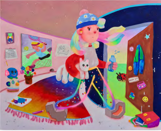
Super Future Kid. Game, Set and Match, 2024. Acrylic, airbrush, and acrylic gouache on canvas 32 x 40 inches