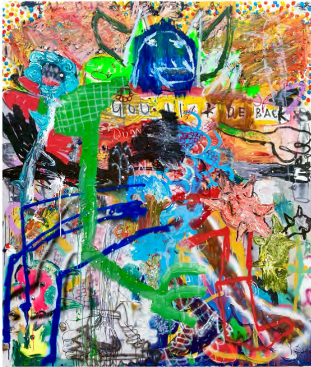
Felix R. Cid. Untitled (When You Lick the Back en el Canpo), Oil, graphite, spray paint, rocks and acrylic on canvas 74.8 x 63.5 inches