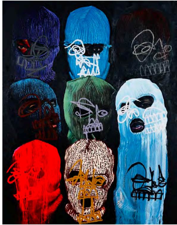
Malik Roberts. Shiesty Season, 2024. Oil on canvas. 60 x 48 inches.

Super Future Kid (East Berlin, DDR) creates vibrant and whimsical compositions influenced by her early childhood in East Germany. After the sudden influx of new technology, neon colors, and fantastical toys in post-reunification Berlin, her work offers an escape into a saturated sensory experience reminiscent of that era. Her immersive creations invite viewers into a world where reality and fantasy intermingle, using expressive landscapes and colorful compositions to explore existential musings. Her work has been exhibited internationally in cities such as Amsterdam, Berlin, Copenhagen, Los Angeles, Miami, New York, Hong Kong, Bangkok, and Tokyo.