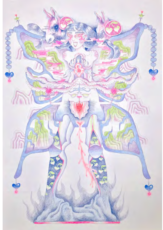
G.E. Liu, If Only Seen Through the Lens of the Past , 2024, Graphite and colored pencil on paper, 31 x 21.5 inches

Han Jimin's (Seoul, Korea) serene compositions explore identity, connection, and loss, within contemporary Seoul. Using soft, mid-range hues, her paintings create a tranquil yet melancholic atmosphere. Han's works, inspired by personal life and careful observation of others, capture the nuanced emotions of solitude, longing, and the hope for connection in a rapidly changing world.