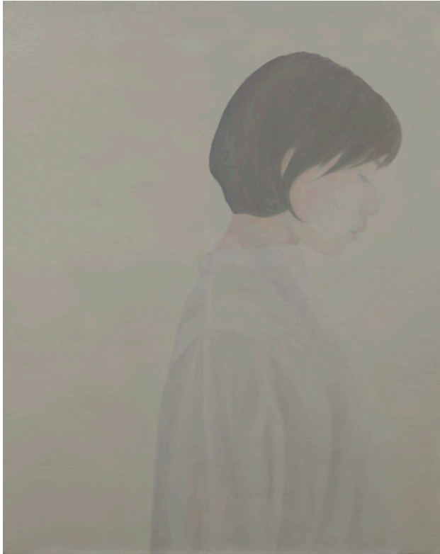
Han Jimin, Slow Movie 2 , 2024, Oil on canvas, 35.8 x 28.6 inches