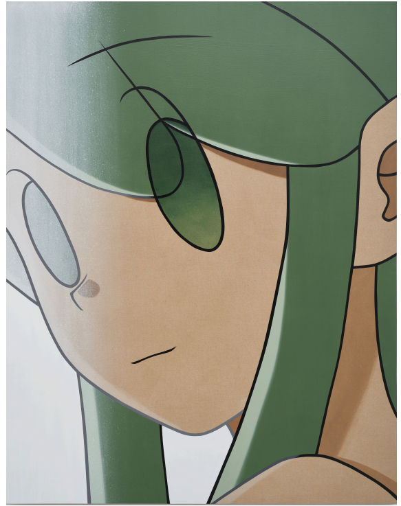
Hyeon O, The Last Scene, Acrylic on fabric on wood panel, 46 x 36 inches

Felix R. Cid (Ibiza, SP) grew up in Madrid and studied art and photography at a young age. He graduated from Yale's MFA program where he first developed his playful aesthetic language and unconventional process. Working in what he calls "El Canpo," an intentional misspelling of "El Campo" (meaning field in Spanish), Cid works exclusively in a field on the coast of Ibiza. As such, Cid is immersed in the natural elements of the island, allowing the textures and materials of the land to inform his process. El Canpo, as described by Cid, is not only a place but a "state of mind." It encapsulates the creative push and pull of "finding that moment" where time stands still and mindfulness and presence reign.