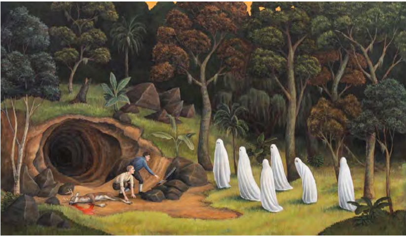
Marcelo Canevari, Hunter's Hour 2024, Oil and acrylic on canvas, 28.3 x 47.2 inches