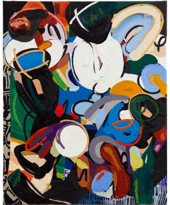
Jonni Cheatwood, This Moon is Bone Broke, 2024, Oil and acrylic on canvas and sewn textiles, 30 x 24 inches

Marcelo Canevari's (Buenos Aires, Argentina) meticulous illustrations of Argentinian nature draw from his background as a scientific illustrator and his work with the Argentine Museum of Natural Sciences. His expertly painted canvases show scenes of pagan ritual, reminiscent of surrealist folk art. Canevari ultimately displays a profound reverence for the natural world and its inhabitants, meticulously capturing its intricate beauty, complexity and uncanniness. His works were selected for the XI National Painting Award Banco Central, the 13th and 14th UADE National Contest of Visual Arts and the UNNE Prize.