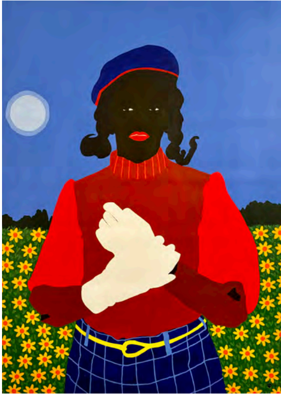
Mamus Esiebo, Lady in Red, 2024, Acrylic on canvas, 50 x 36 inches