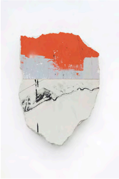
Tilt. New Territories 5, 2024. Mixed media on plasterboard and concrete 48 x 36 inches