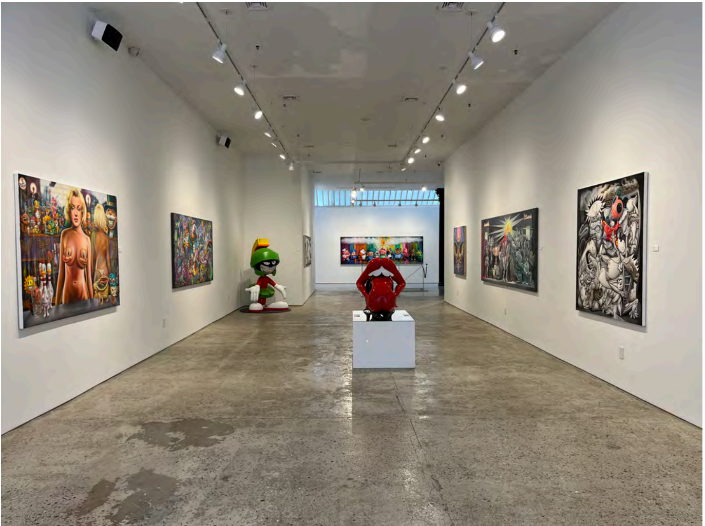
Installation image of Allouche Gallery NYC, artwork courtesy of Ron English.