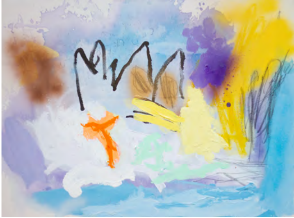
Daniel Núñez, The Astral Clucker's Awakening , 2024, Mixed media on canvas 21.3 x 28.7 inches