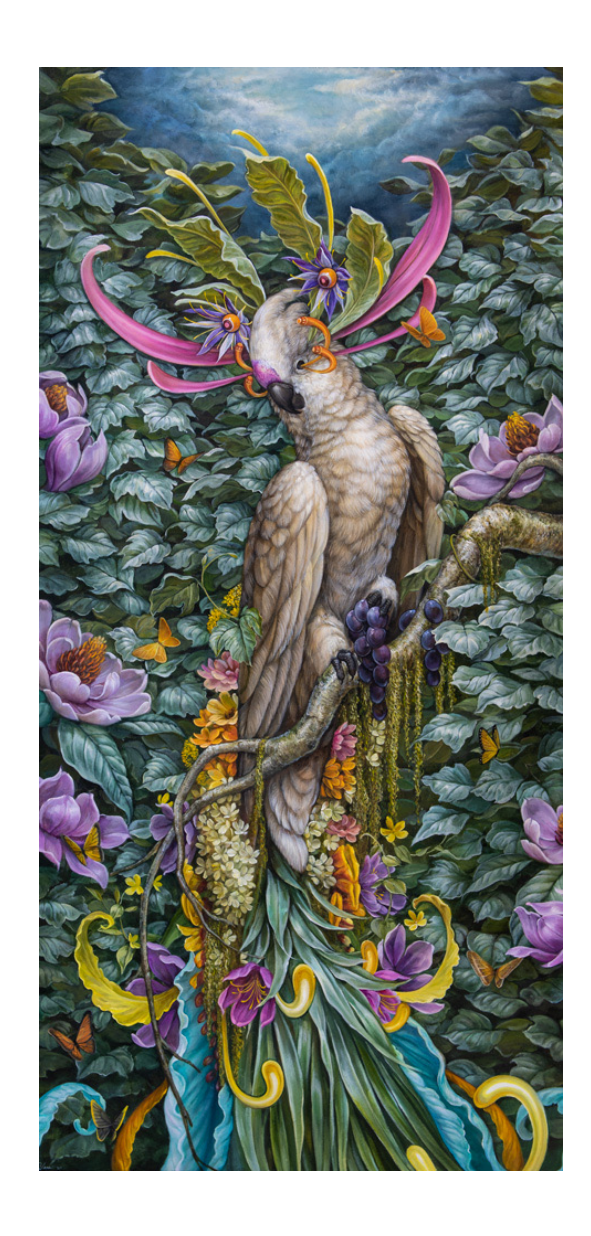
Hannah Yata Breath of the Morning, 2024 Oil on canvas 54 x 26 inches