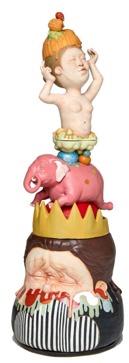
Kyungmin Park Desires and Deluge, 2024 Stoneware, underglaze, glaze 51 x 20 x 17 inches