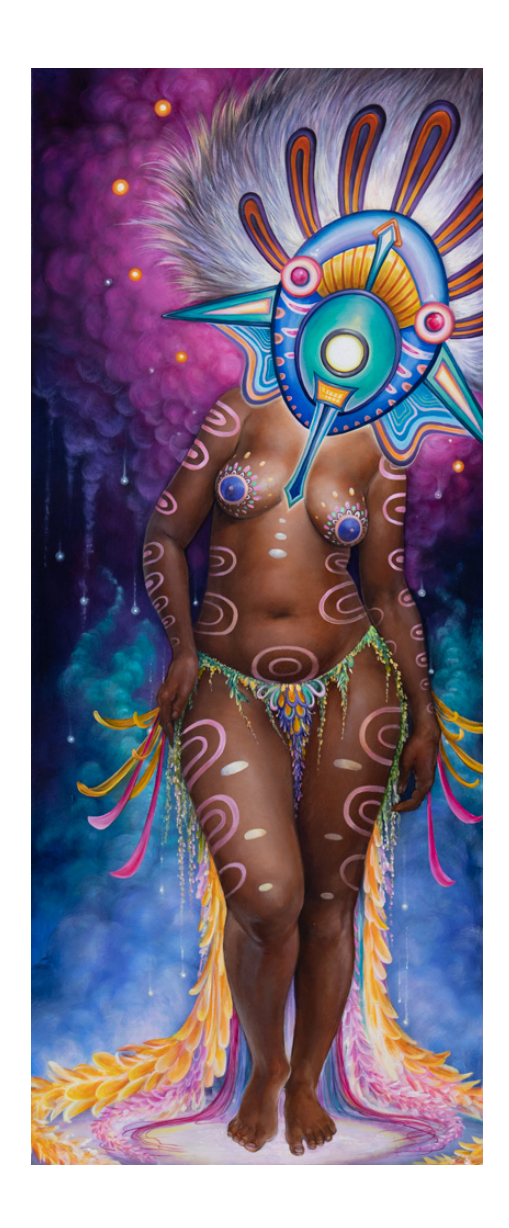
Hannah Yata Electrophoresis, 2024 Oil on canvas 48 x 24 inches