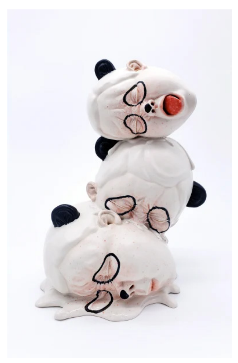
Kyungmin Park Meltdown, 2021 Stoneware, underglaze, glaze 12.5 x 8.5 x 7 inches