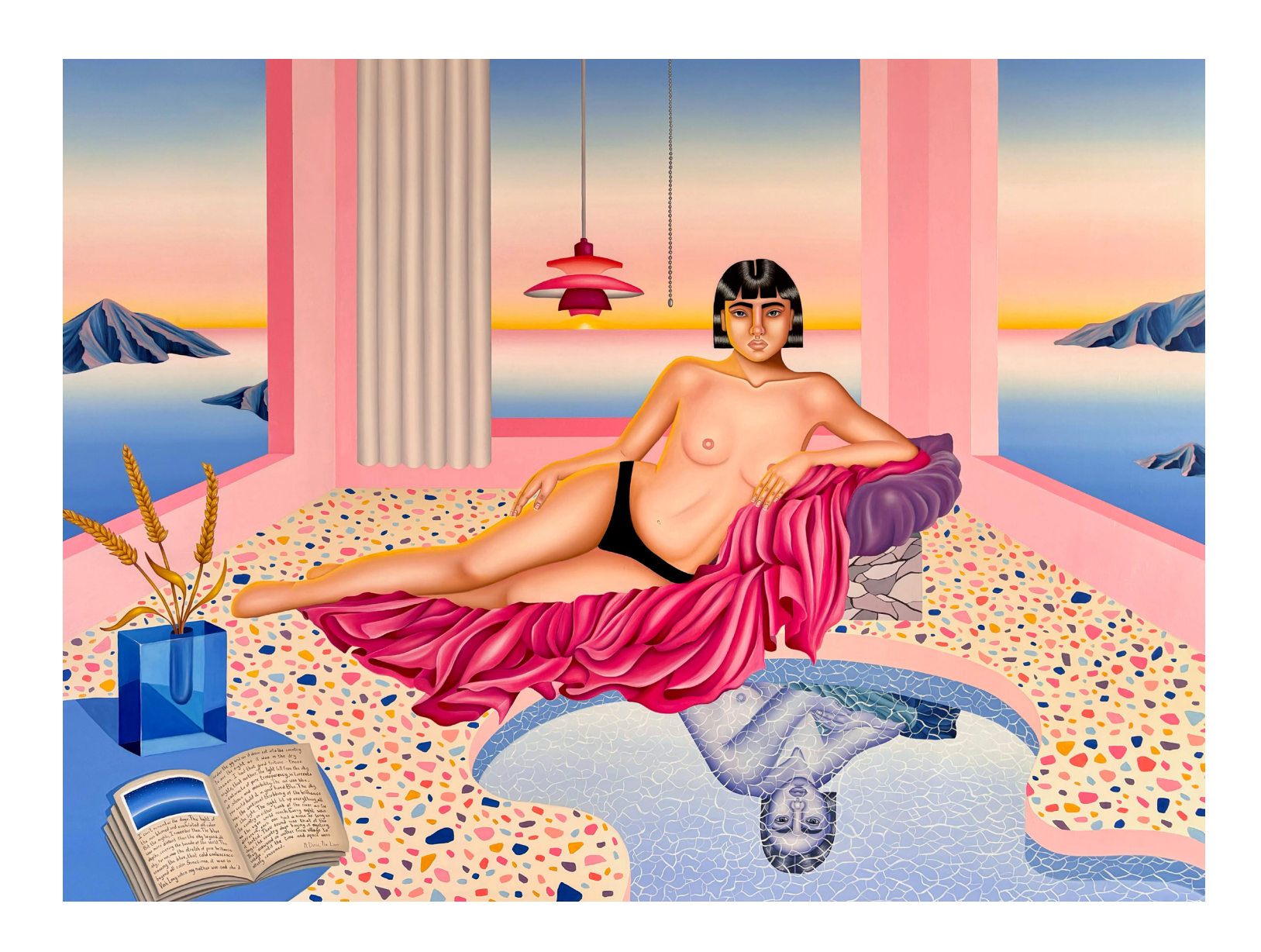
Sophie-Yen Bretez Bright blue eyes, round cheekbones, Honey skin, sharp steel hips, Dark eyebrows, heart-shaped lips, -Like the waves, like the stones, 2024 Oil on linen 42 x 58 inches