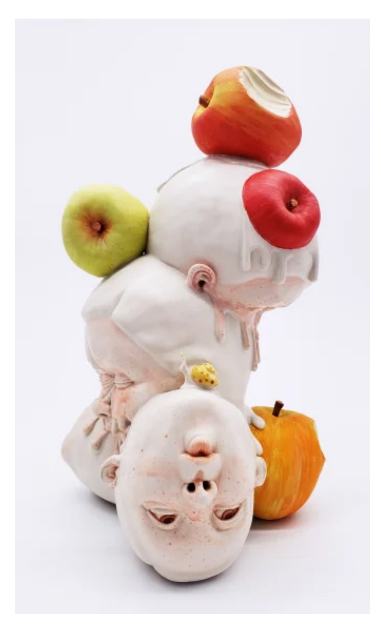
Kyungmin Park One Bite at a Time, 2021 Stoneware, underglaze, glaze 13.5 x 9 x 9 inches