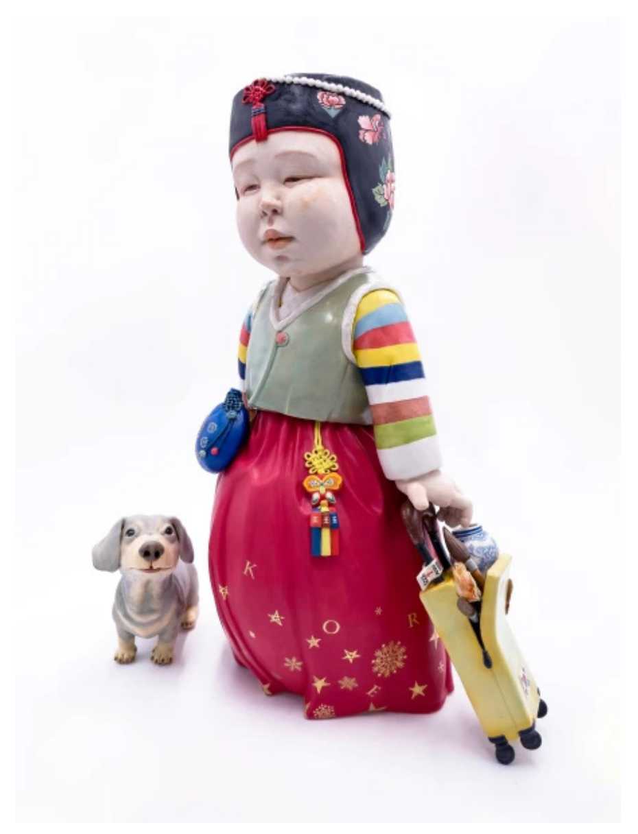
Kyungmin Park Jan 6, 2006, 2023 Stoneware, underglaze, glaze, resin, paint 19.5 x 13 x 13 inches