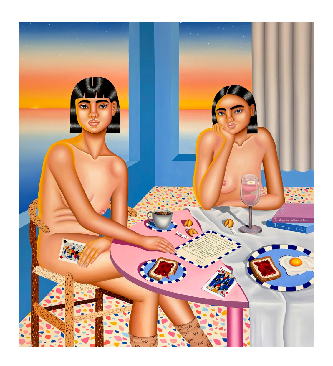
Sophie-Yen Bretez The sky was still asleep A world without colour Then the dawn was born And so it was All mornings All at once, 2024 Oil on linen 46 x 42 inches